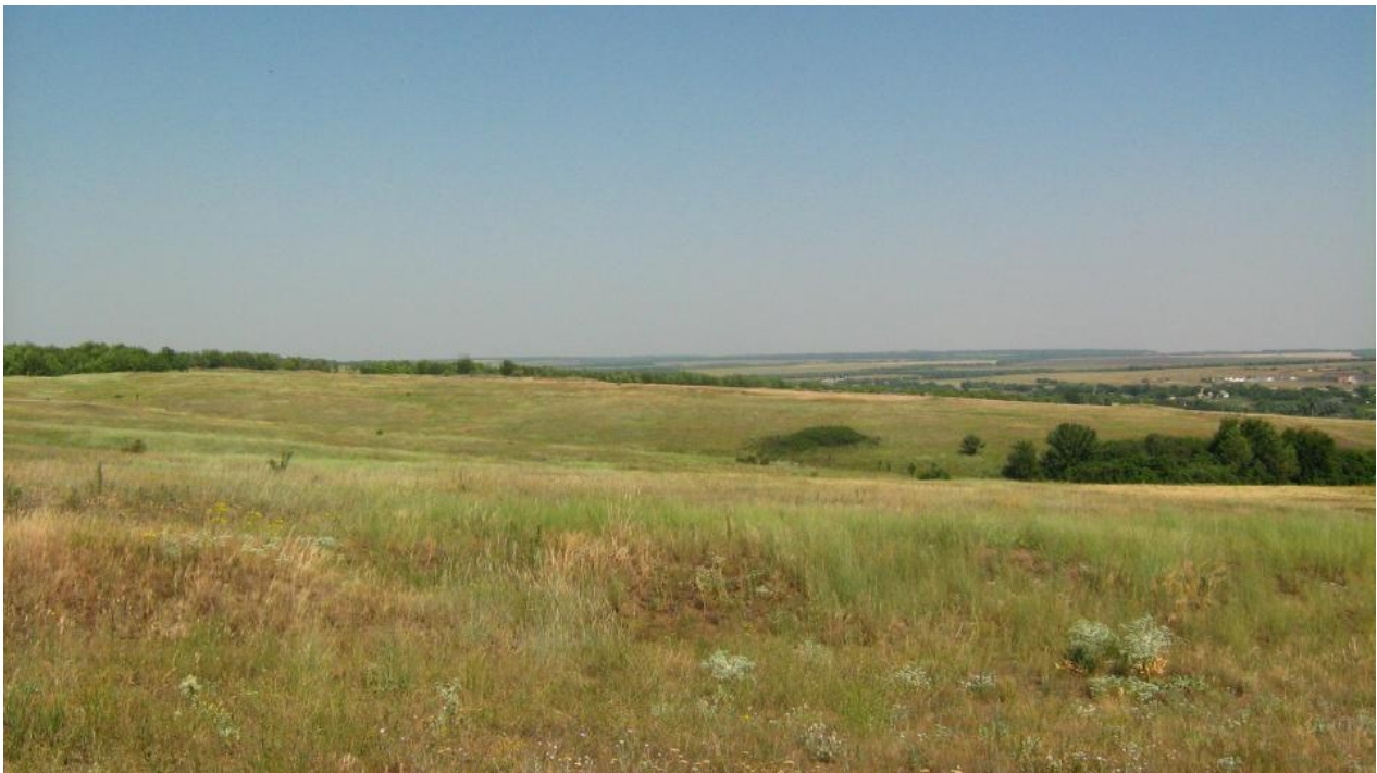
Southern Ukrainian Steppe (Zaporizhia region) in 2007

The area was populated, beside Tatars, by another Muslim nomadic people, the Nogais, which lived in the Northern Black Sea region from the end of the eighteenth to the middle of the nineteenth century and who also kept camels in their households. Emigration of these two ethnicities to the Turkish Empire during the nineteenth century and their eviction from Crimea during the Second World War were central elements of the gradual disappearance of camels from contemporary Ukraine during the twentieth century, together with the plowing of the steppe which led to the transformation of the nomadic cattle economy into settlement agriculture during the nineteenth century, as well as the development of transport infrastructures and agricultural mechanization. Now there are only small numbers of camels that are used exclusively as tourist attractions.