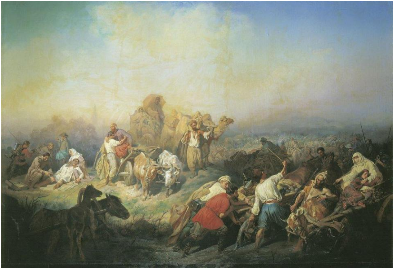
The use of camels in military times

of all spheres of life in the new imperial territories, the regional authority borrowed some economic traditions from the Crimean Tatars, including the use of camels. This was due to both the need to facilitate the painless integration of the local people and the peculiar natural conditions of the new lands that were uncharacteristic for the Russian Empire.