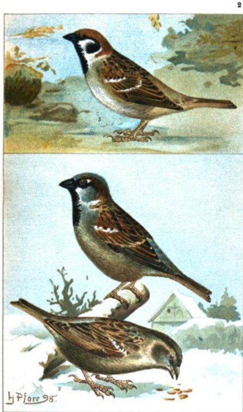
Hausperling. Passer domesticus .

and municipal authorities had supported the move. It occupied a central location in a popular urban park. Many of the cats had owners, and the staff members of the bird observatory did not bother to ask for a license to kill. In fact, they did not only kill the cats but also fed their flesh to injured birds of prey and used the remains to stitch fur coats for their private use. It was as if the friends of the birds had been out to destroy their local reputation.