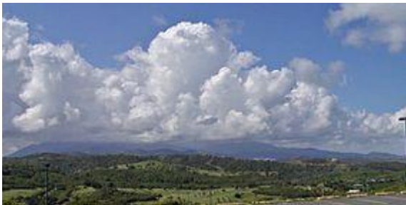
Distant view of El Yunque National Forest. The mountain was said to resemble a blacksmith's anvil.

When the United States acquired formal colonies in the Philippines and Puerto Rico after the Spanish-American War of 1898, it developed its first serious encounter with tropical forests as part of the construction of US conservation policy. The creation of national parks was not at the forefront of US concerns in the islands. Rather, the government scouted for likely sources of timber for commercial development, and to conserve forest areas to prevent future world timber famines.