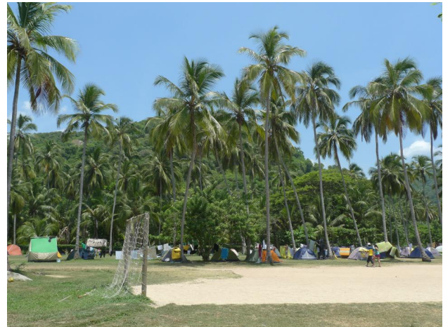
Camping site at Cabo San Lucas