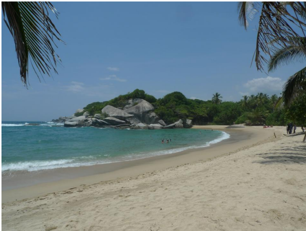
Beach at Cabo San Lucas, Tayrona National Park