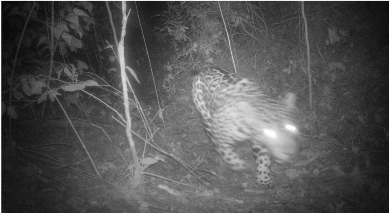
Jaguar ( Panthera onca ), Chengue, Tayrona National Park

Camera trap photograph, 2012; Archivo Parques Nacionales de Colombia.