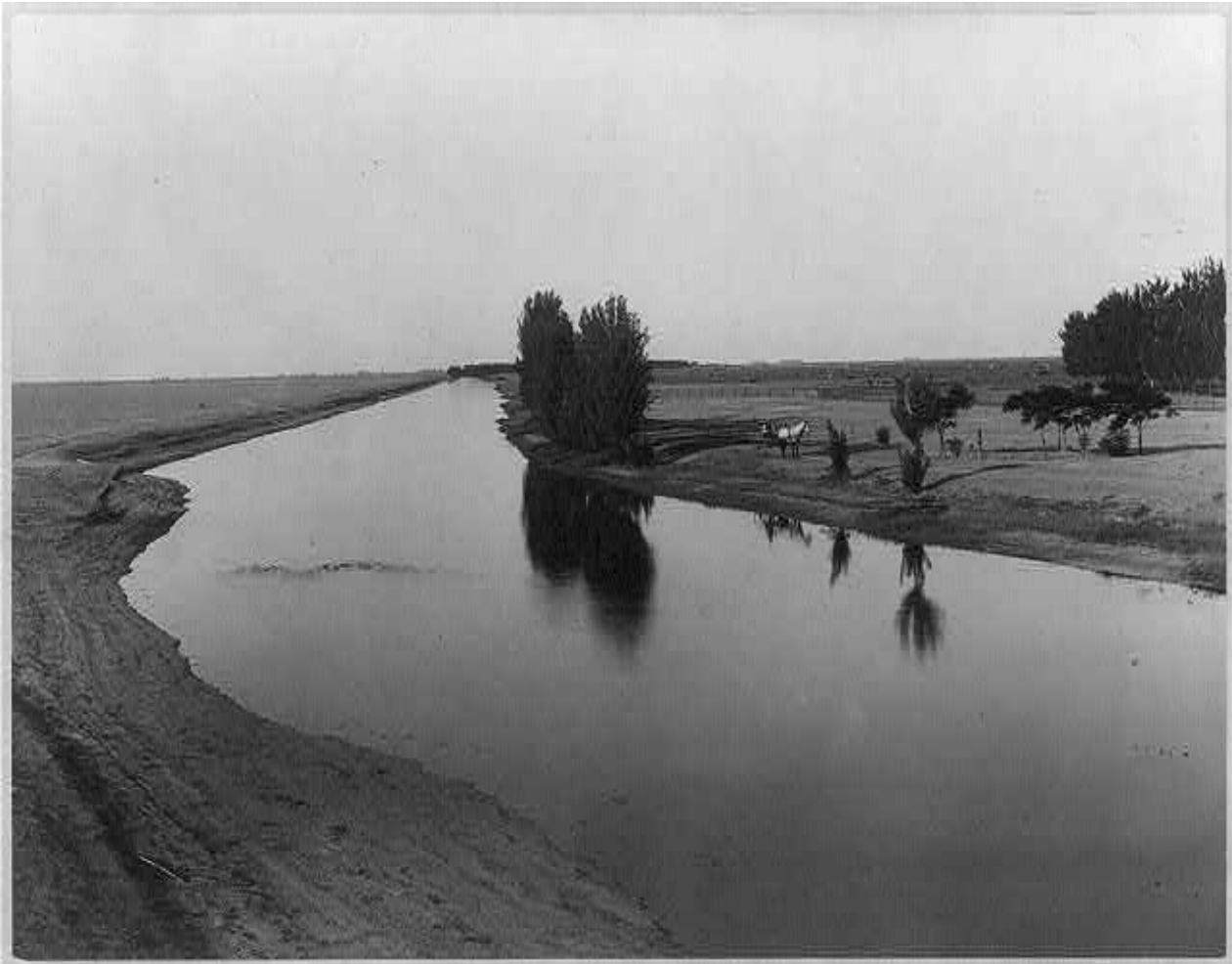
The Calloway Canal near the headquarters of the Poso Ranch in Kern County, California.