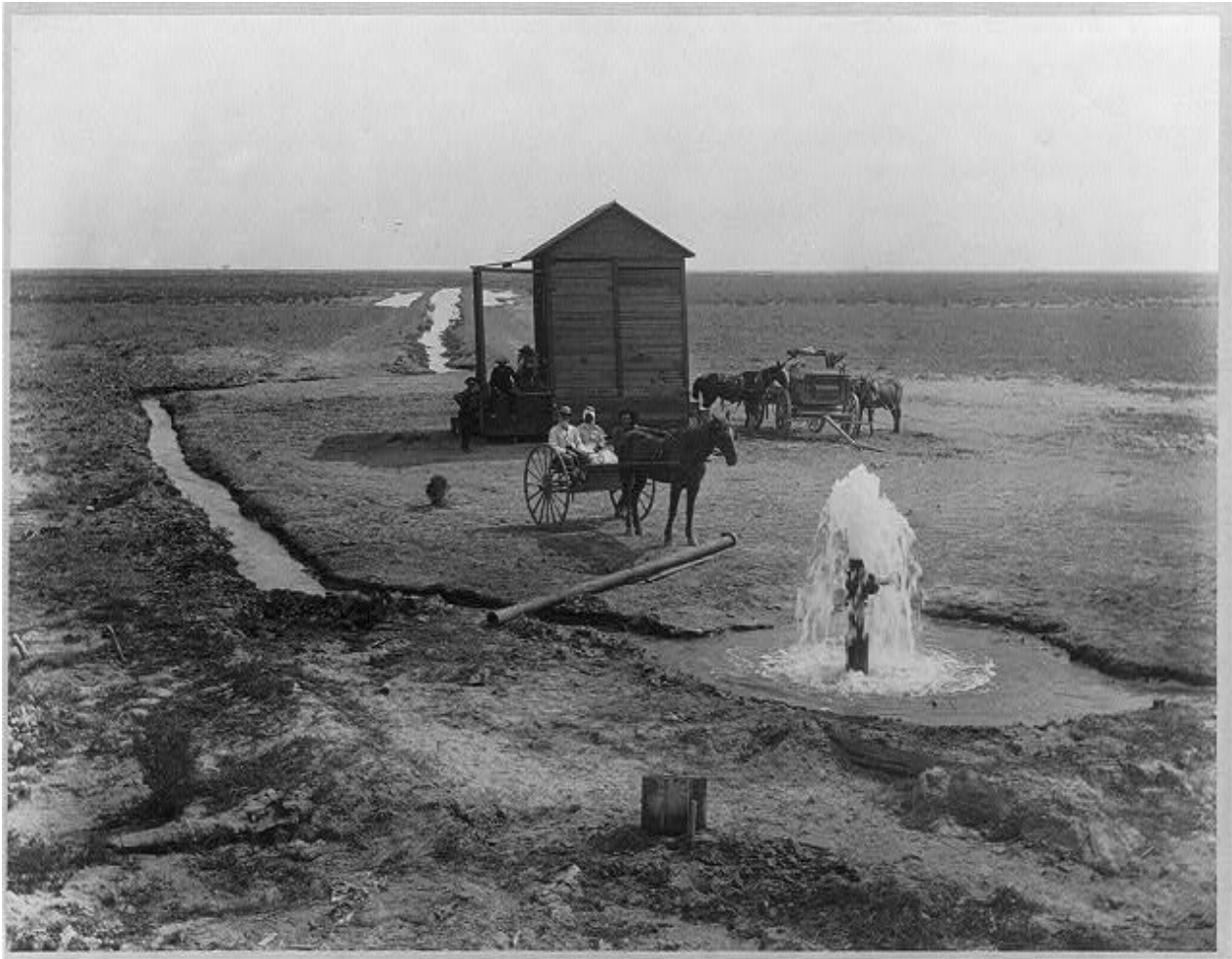
Horse-drawn cart beside artesian well in Kern County, California.