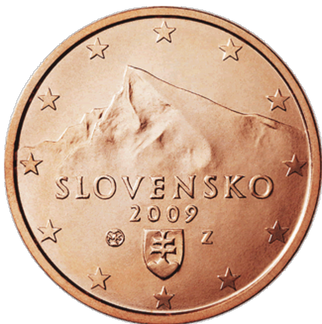
A Slovak 5 cent coin showing the Tatra peak Kriváň.