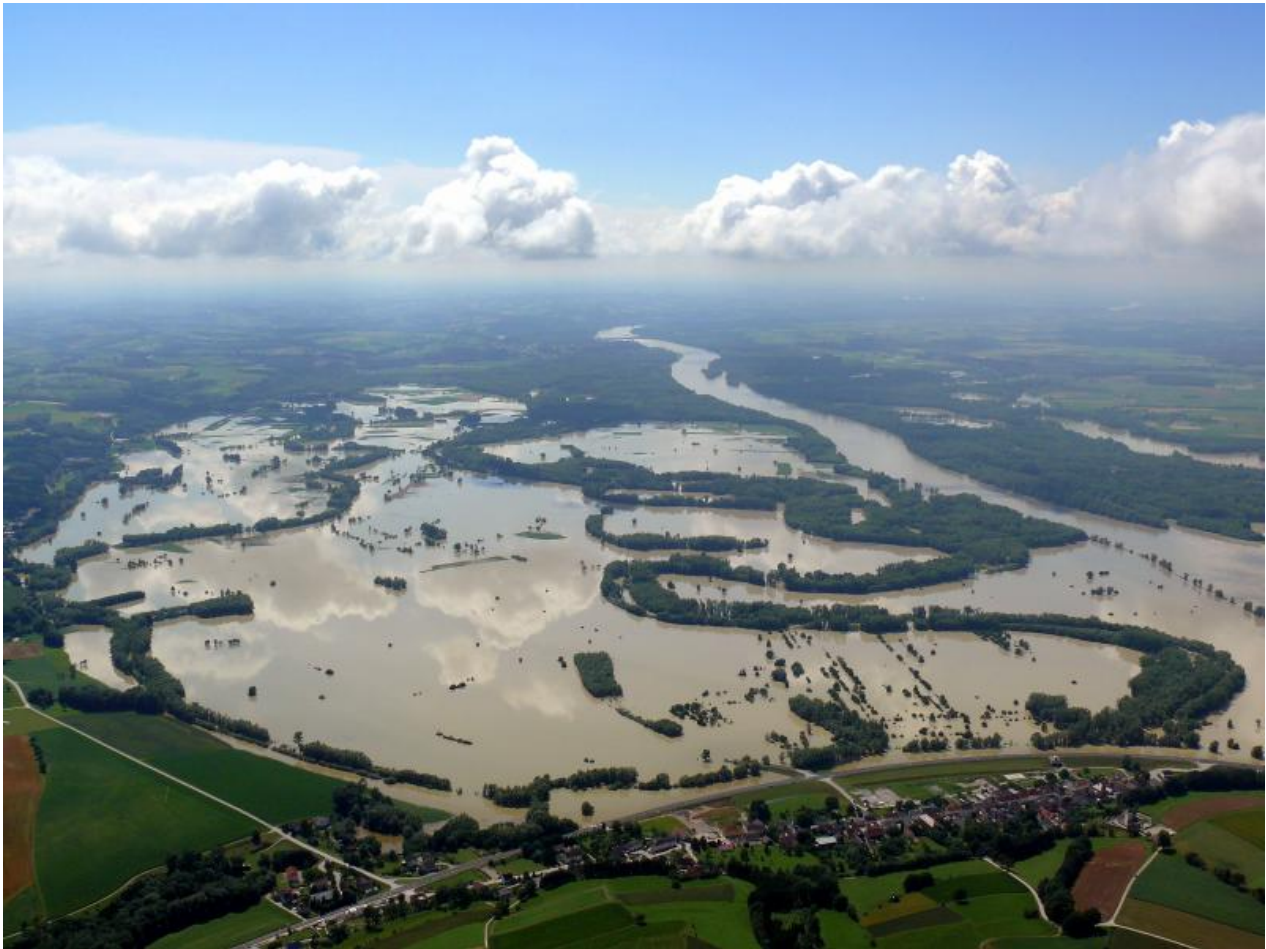
Machland floodplain during a minor flood 2009.

Friedrich Furlinger, Wallsee, Lower Austria, 2009.