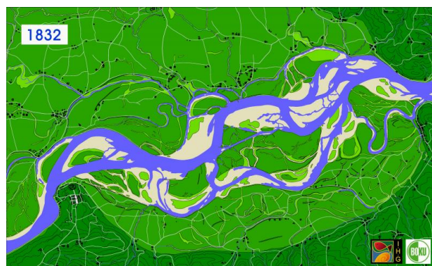
Danube in Machland (1832)

The copyright holder reserves, or holds for their own use, all the rights provided by copyright law, such as distribution, performance, and creation of derivative works.