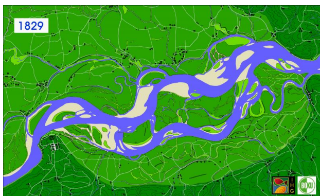
Danube in Machland (1829)

The Machland prior to the excavation of the shipping channel through the Weidenhaufen Island in 1829.