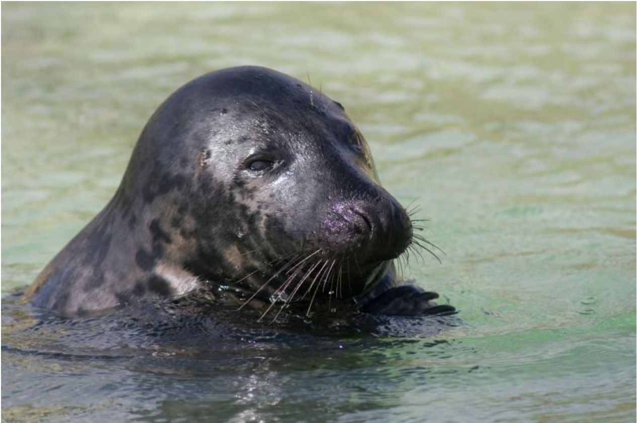
Ignorant of borders: The grey seal, extinct for centuries, returned to the Wadden Sea in 2007.

Slowly capacity and regime building processes began. In 1965 the interdisciplinary International Wadden Sea Working Group was formed to coordinate the research and collect data; in 1978 the three nations involved pursued a common conservation policy; in 1982 a Joint Declaration was signed; and in 1987 a common secretariat established in Wilhelmshaven (Germany).