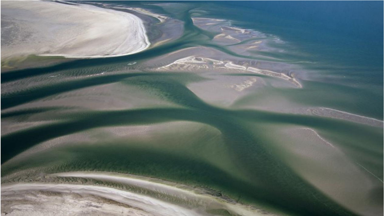
View of the Wadden Sea—a landscape in flux

Anna-Katharina Wöbse and Hans-Peter Ziemek