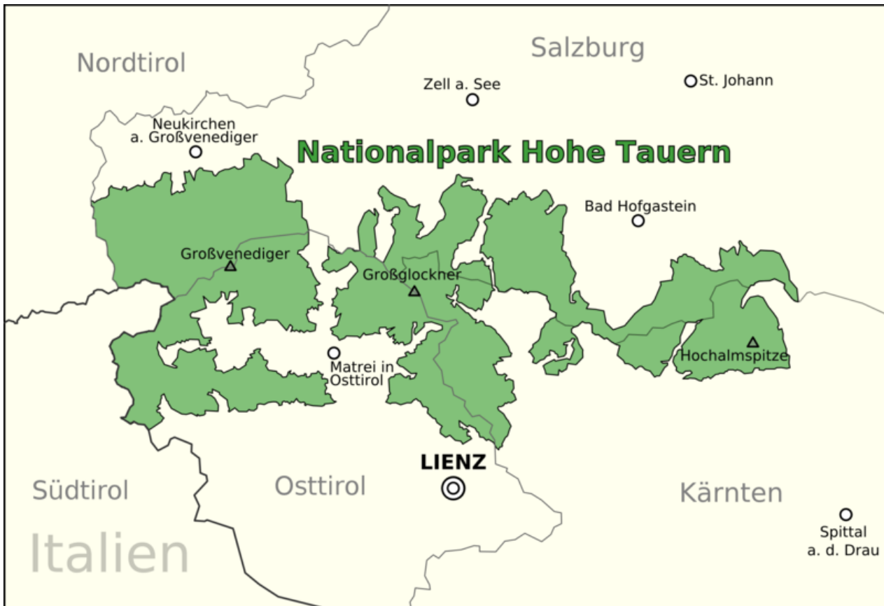
Map of the Hohe Tauern National Park

Besides the upheavals caused by war, harmonizing (or deflecting) social interests was the main reason for the time-consuming process of achieving the designation of the national park. Bringing proponents and opponents closer together and mediating between local needs and international standards took many very small steps. Hardly any other national park featured as many land owners who needed to be convinced of the significance and benefits of such a project. A 1995 mission statement called it "a miracle of spatial planning and conservation." This miracle did not come about through divine or human intervention but was the result of endless talks and of mobilizing new sources of income for the region.