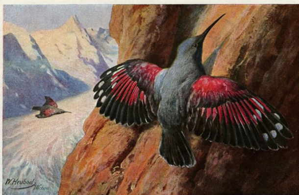
Der Alpenmauerläufer die gefiederte Alpenrose des Naturschutzparkes im Großglockner-Gebiet.

Kingfisher and wallcreeper as icons for Verein Naturschutzpark's ambitions to create nature parks in the "typical German landscapes" of heath (Lüneburger Heide) and Alps (Hohe Tauern)