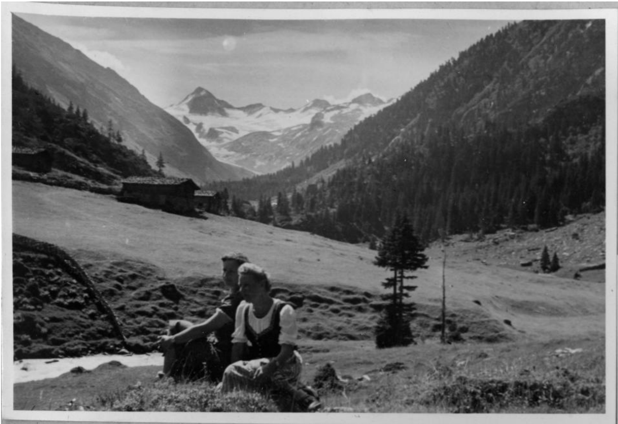
Postwar nature idyll: The "Musteralm" Schidhofalm in the Obersulzbachtal, photographed by leading Austrian conservationist Lothar Machura (1950)

All rights reserved © 1950 Lothar Machura, Verein Naturschutzpark