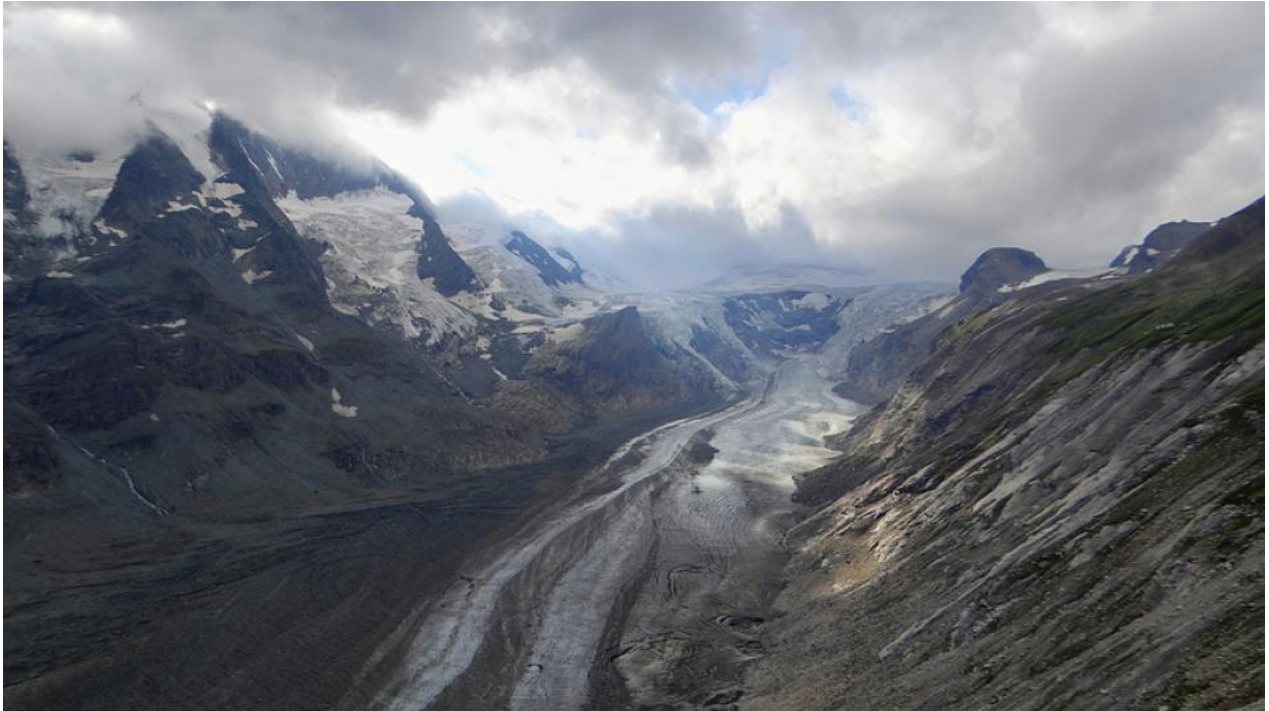
The Pasterze glacier in the Hohe Tauern National Park