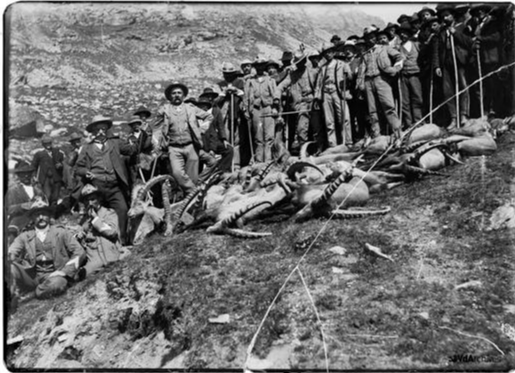
A scene from the royal hunts in the Gran Paradiso area, early 20th century

became something of a no-man's-land and a veritable paradise for poachers. Ibex and chamois ( Rupicapra rupicapra ) hunters, dressed in military outfit and armed with machine guns, were a common sight before 1922.