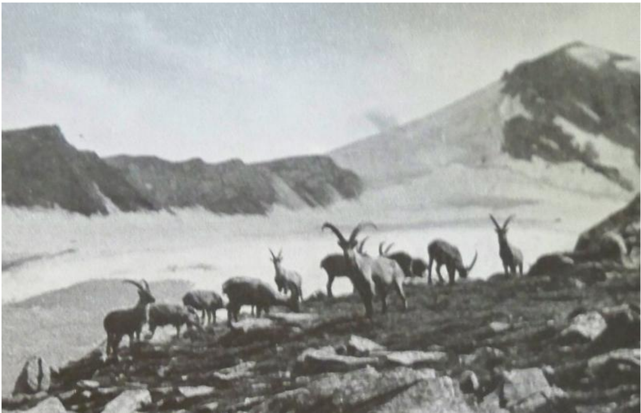
Ibex in the Gran Paradiso National Park (1933)

The Gran Paradiso area has historically been at the core of attempts made by the Piedmontese royal house to preserve the ibex ( Capra ibex ). By 1821 the Piedmontese government had forbidden ibex hunting. Nonetheless, poaching continued almost unabated on the Gran Paradiso massif, where between 1850 and 1856 King Vittorio Emanuele II established a royal hunting reserve, based on a complex system of tenancies with private landowners. This act saved the Alpine ibex from extinction and the ibex populations in the Alps today stem from this original stock.