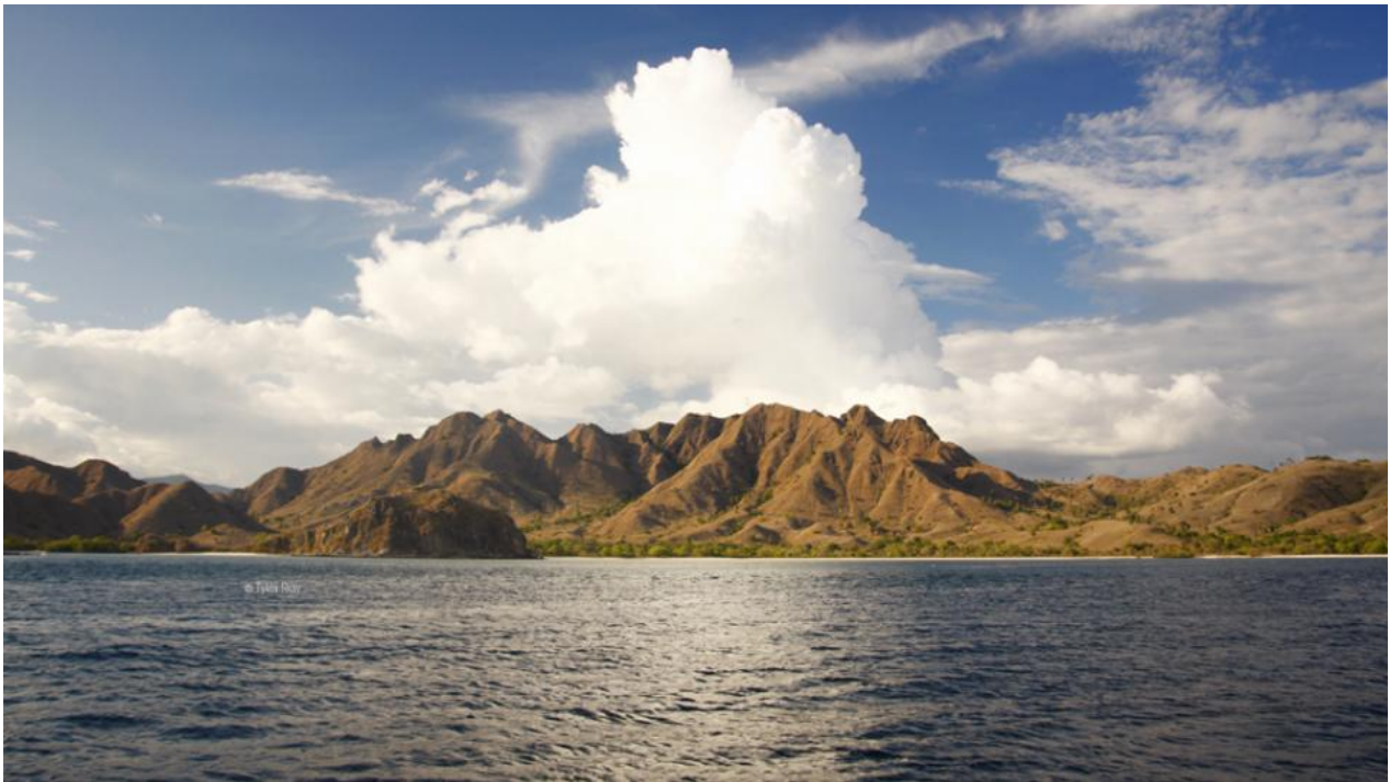
Komodo National Park from seaside