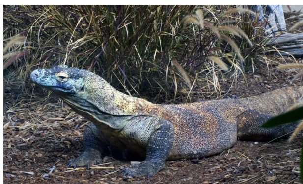
"Komodo Dragon" (2008)