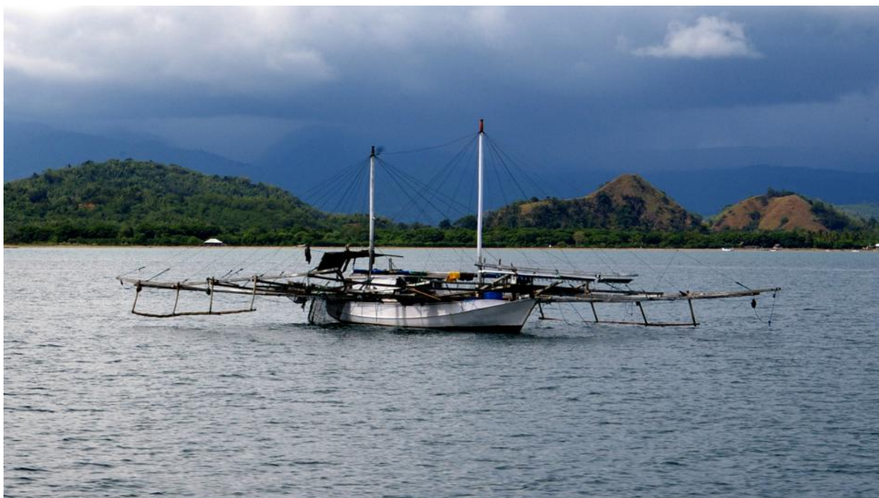
Local fisherboat at Labuan Bajo harbor on Komodo