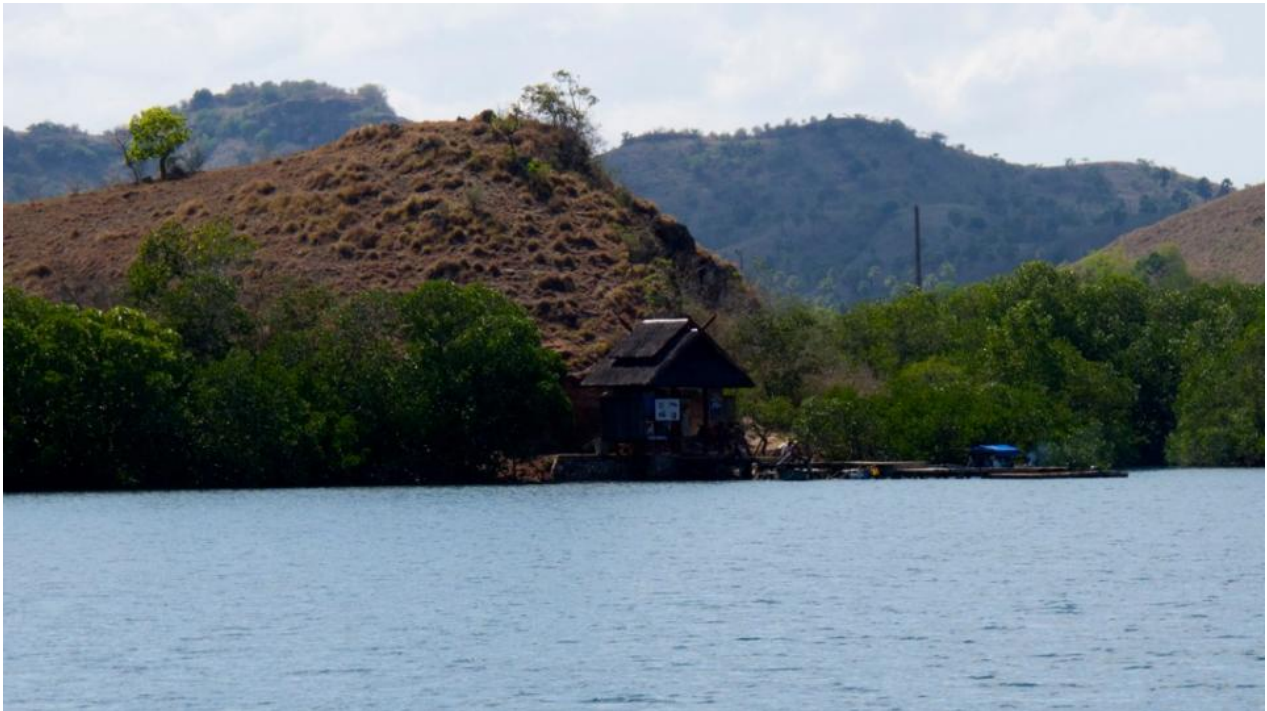
Village on Komodo island