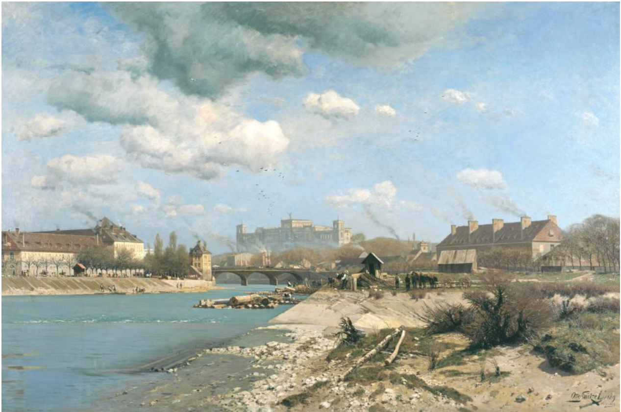
Wharf on Munich's Kohleninsel (Otto Strützel 1889)

All rights reserved © 1889 Otto Strützel. Courtesy of Deutsches Museum - Bildarchiv