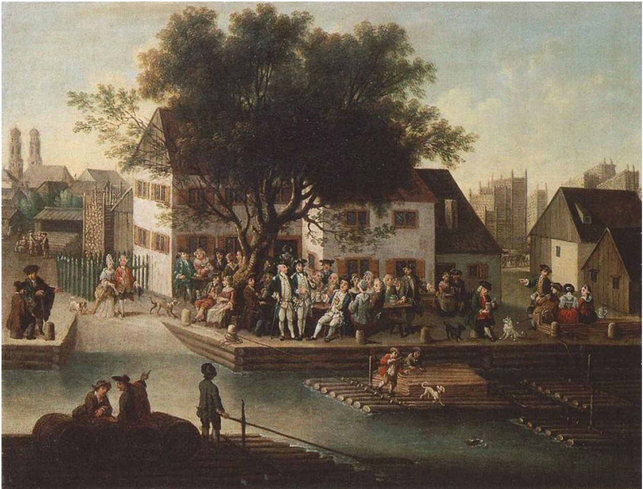
Painting Der Grüne Baum ("The Green Tree") by Joseph Stephan (1767). The green tree was an important landing place and name of a pub on Munich's raft port.

All rights reserved © 1767 Joseph Stephan. Courtesy of Deutsches Museum - Bildarchiv