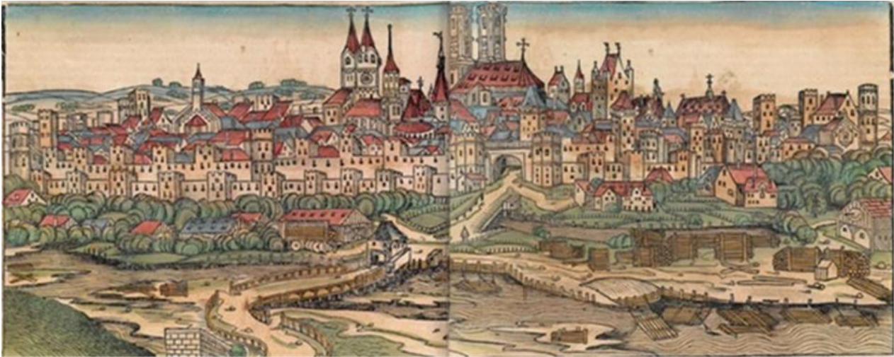
Panorama of Munich in Schedel's Weltchronik (known as the Nuremberg Chronicle ) with rafts in the foreground (1493)