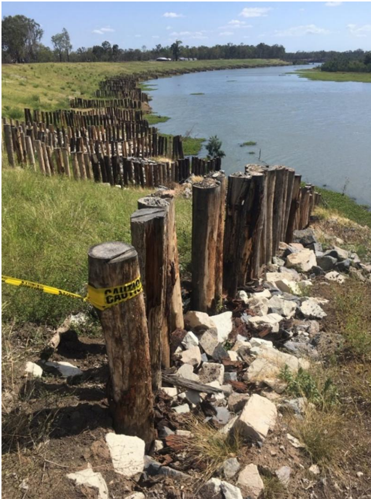
Fitzroy Basin Association Site 7 on the Fitzroy River near Rockhampton, Australia, 2019.

In the Anthropocene, the floodplain is where we plant infrastructure—to eat, sleep, work, and play. Riverbank shape-shifting has thus become highly unwelcome—for both rivers and humanity! Arguably, if there were no landholdings on the floodplain, there would be no need to manage riverbanks.