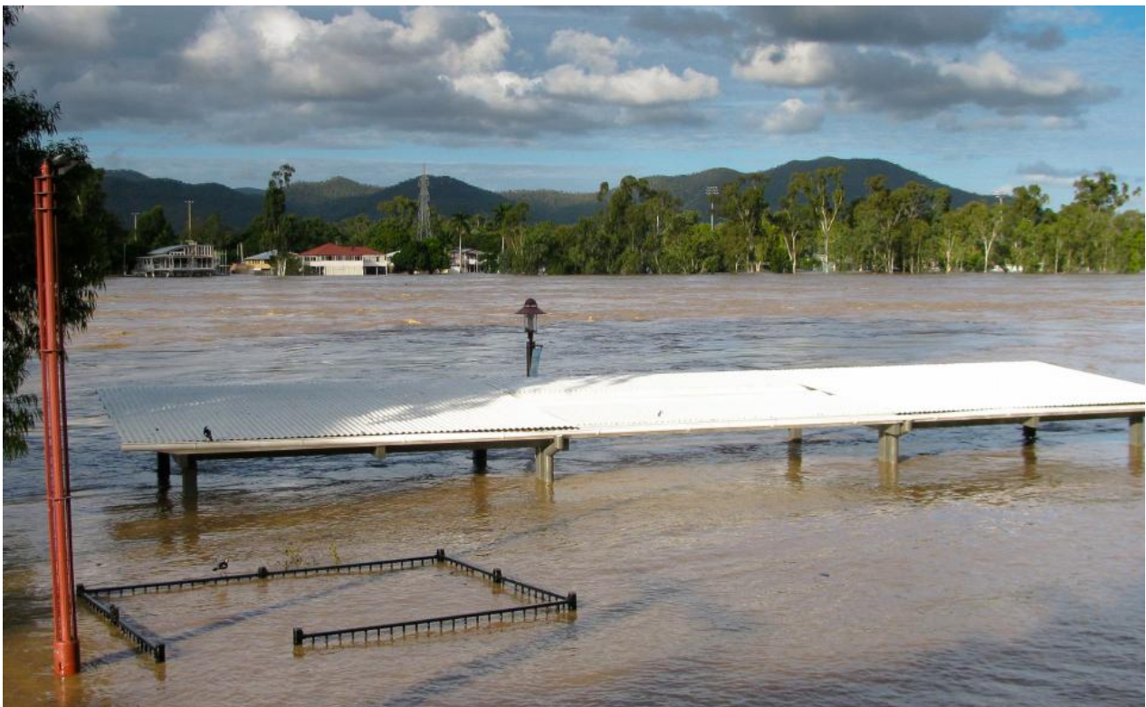
The Fitzroy River in flood at Rockhampton, 2017.

And secondly, upstream land care in which the connectivity and ecology of a river system are holistically recognized could be practiced—not just some de-sludging to treat the symptoms of a larger issue. Much can be learned from expressions of legal and policy rights for rivers in South America, Canada, India, and other places.