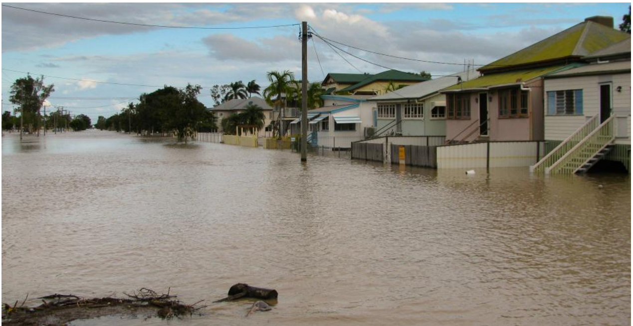
The Fitzroy River in flood at Rockhampton, 2017.

The Fitzroy River sits in the largest drainage basin that flows to the east coast of Australia—and it can be a coffee-colored maelstrom in times of flood. In late March 2017, Tropical Cyclone Debbie wandered inland and soaked the upper reaches of the massive catchment. It took a whole week for the upstream deluge to rush through the regional city of Rockhampton and career coastward to smother the southern end of the Great Barrier Reef with its burden of sludge.