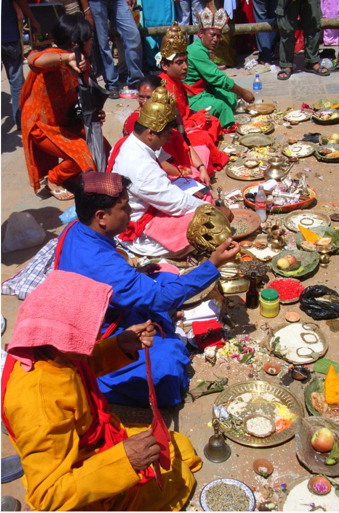
Tantric Buddhist officiants prepare to perform rituals outside Sikwamu monastery ( Tarumūlamahāvihāra ), Kathmandu.