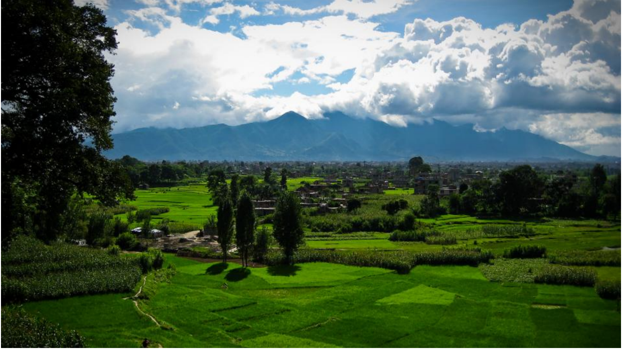
Kathmandu Valley's rice fields in midsummer.