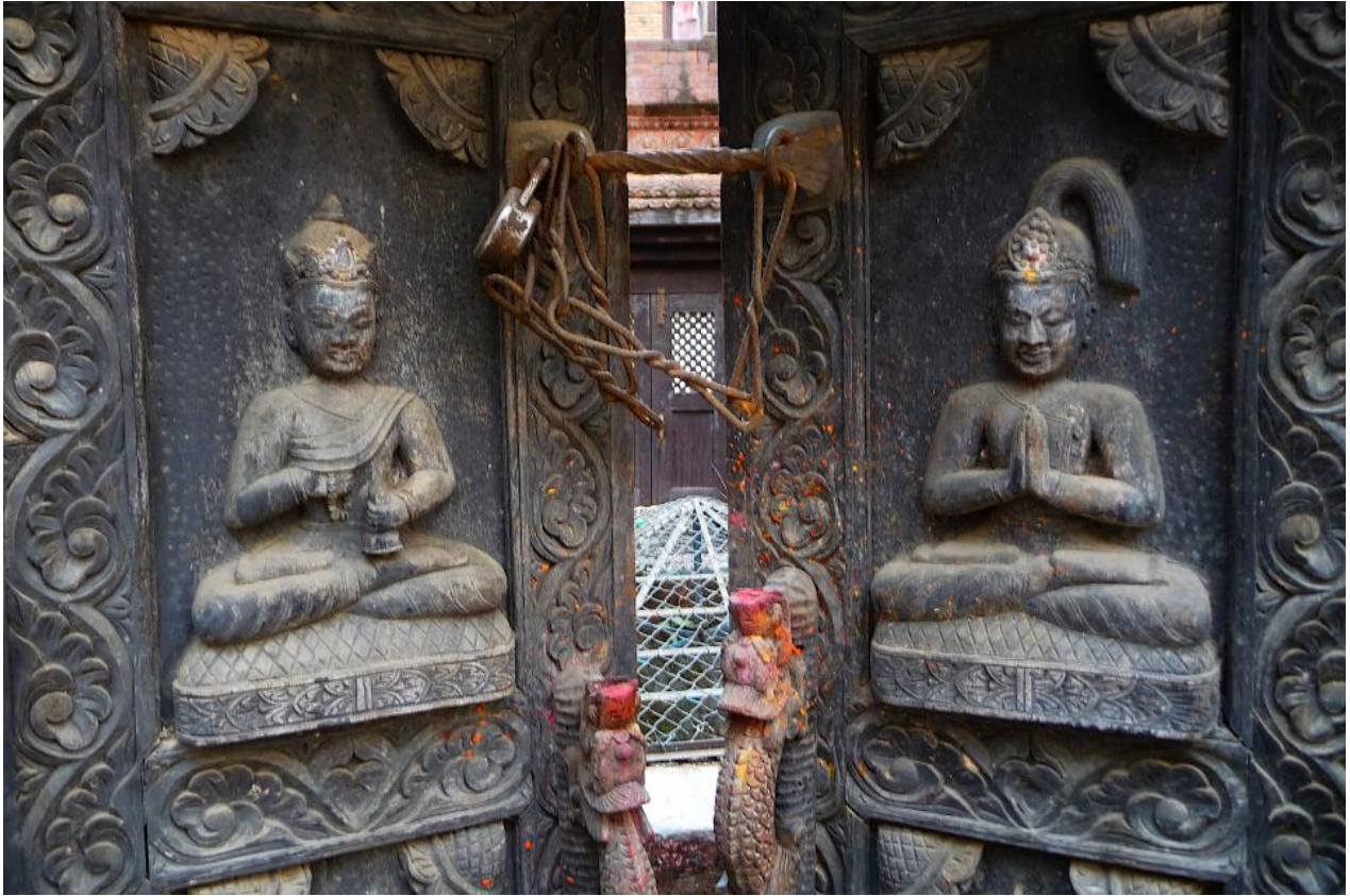
Carved doors portraying Śāntikara (left) and king Guṇakāmadeva (right). Early twentieth century.