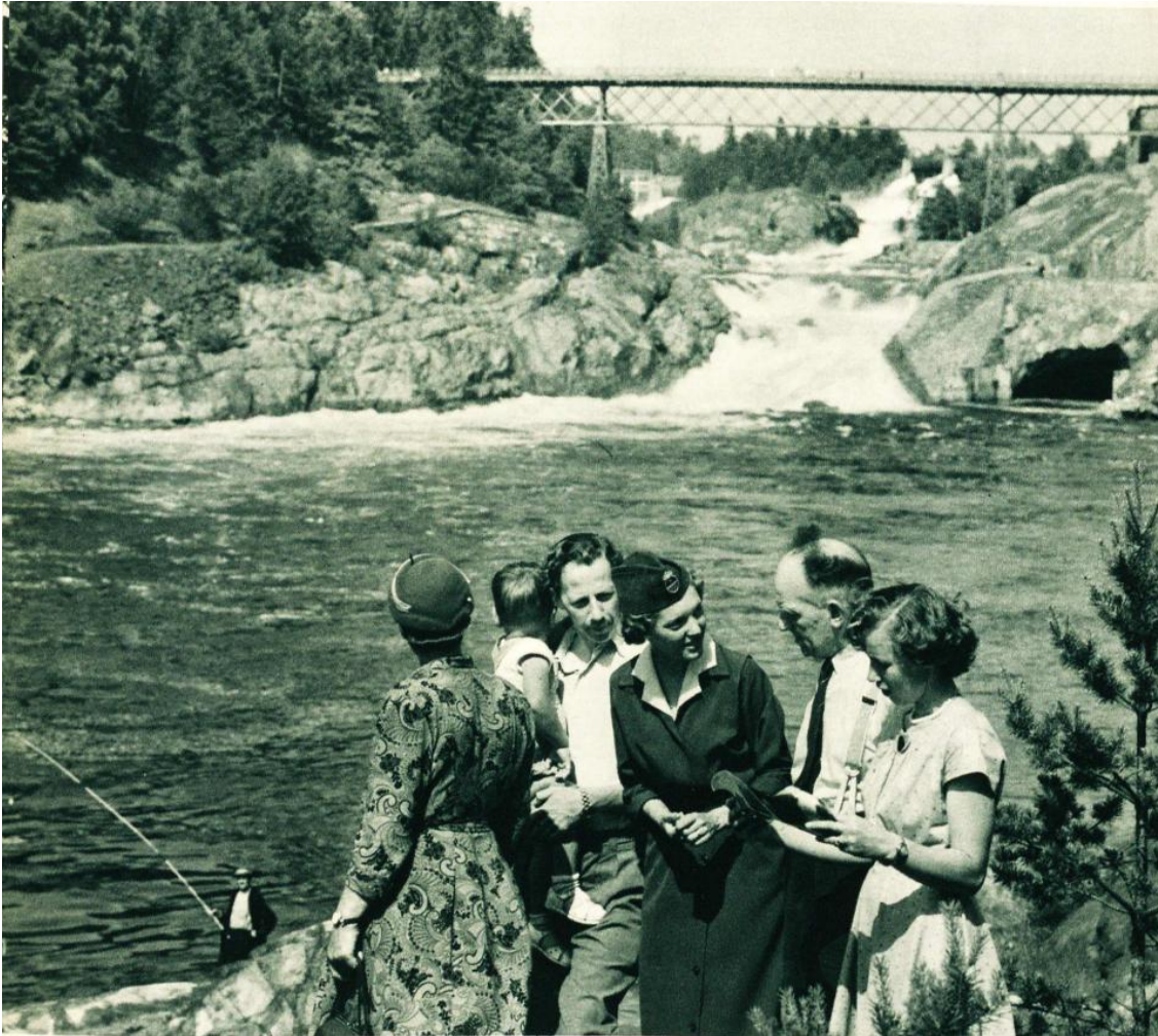
A power plant hostess presents the Trollhättan waterfalls to tourists.

Accessed via Lennart Nilsson and Charlie Cederholm: Strömkarl. En krönika om vattenfall, dess miljöer och människor jubileumsåret 1959 . Fritzes hovbokh: Stockholm, 1959.