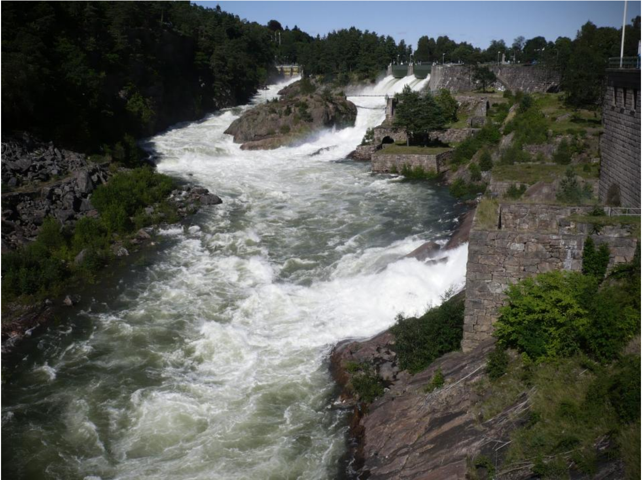
The Trollhättan waterfall seen during Fallens dag in 2015.