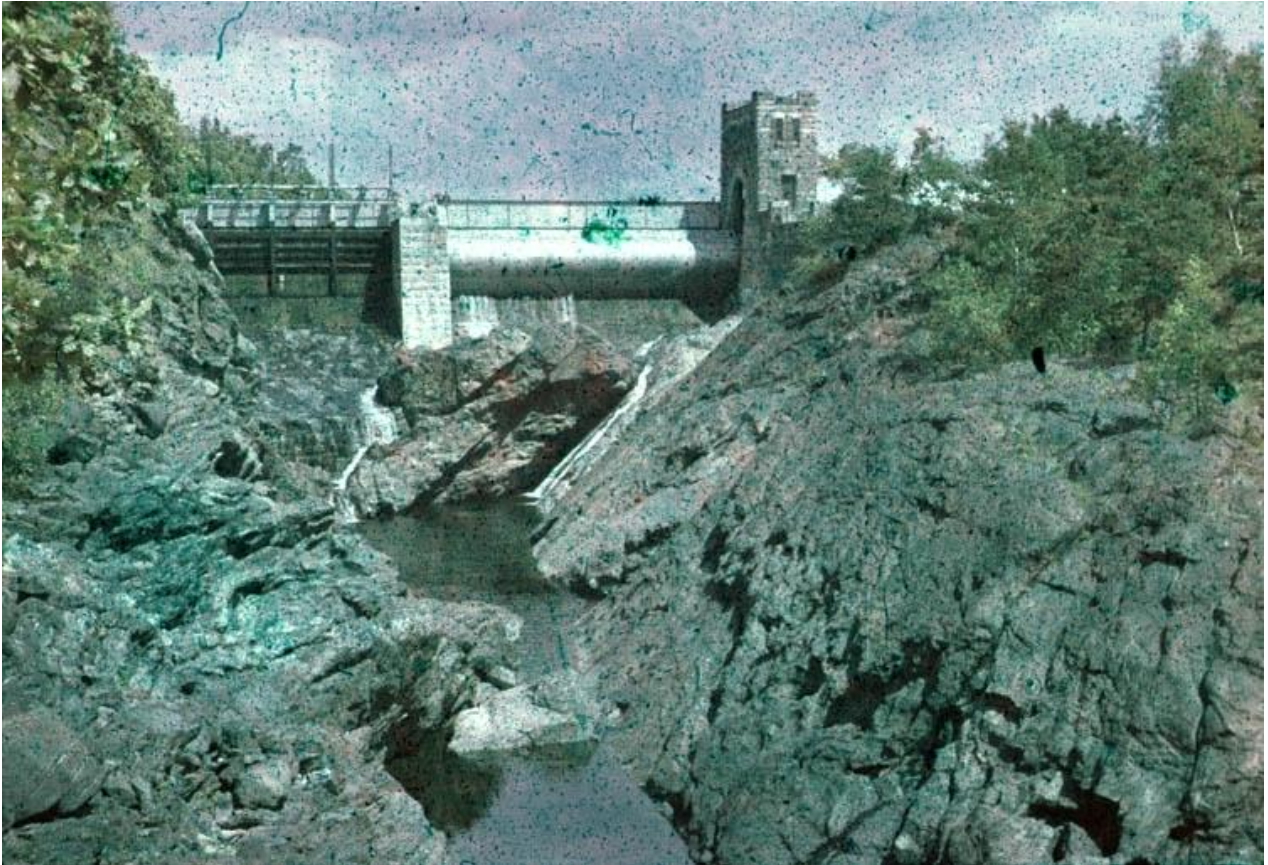
The empty bed of Trollhättan waterfall, 1940s to 1960s.