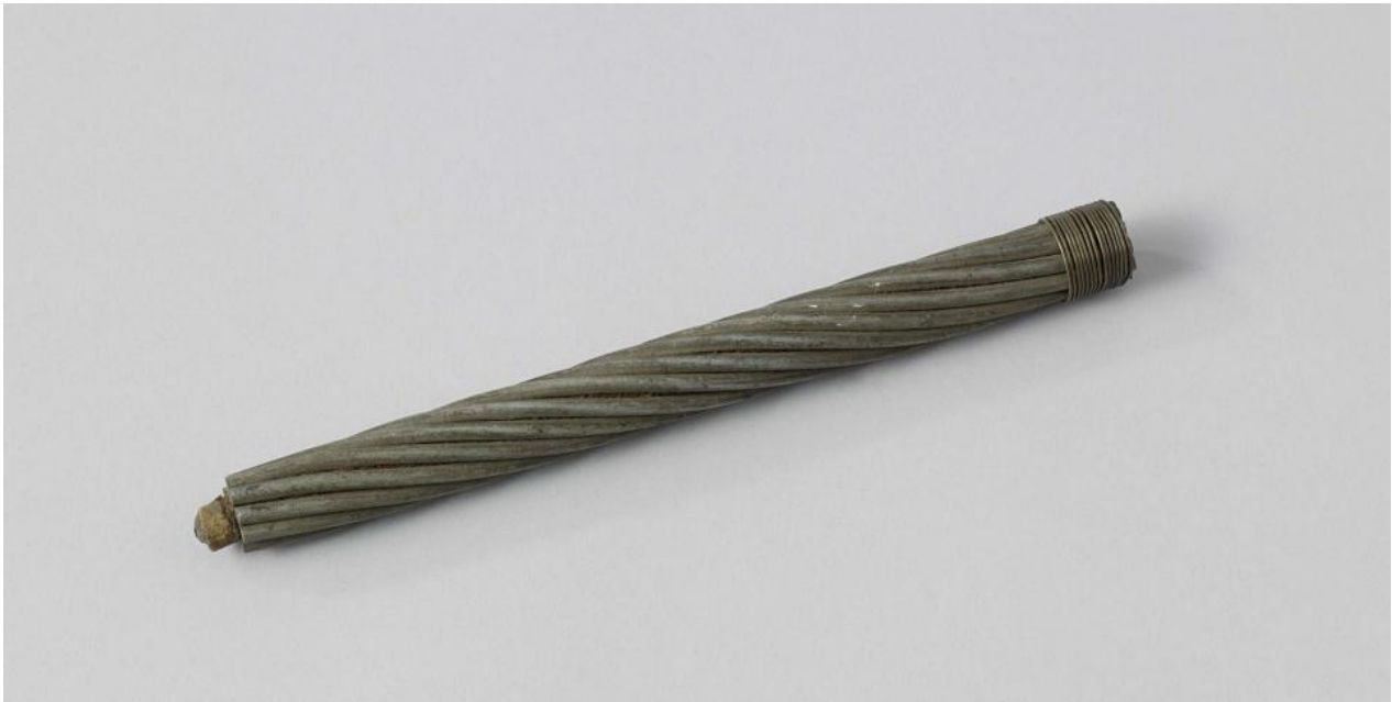
A section of telegraph cable, the copper wire protected by a layer of (probably) gutta-percha and paper, with steel on the outside, ca. 1865–1875.

What, then, caused all these disruptions? Many things, most of them somehow connected to the local ecology. In 1873 the cable was found—to everyone’s surprise—to be damaged by “white ants,” i.e. termites, that had got through the iron protection and eaten into the insulation. This was to be a recurring problem: as Rohan Deb Roy has recently shown, termites were a constant threat to colonial infrastructure. A little later the connection was again cut by the anchor of an American ship. In 1876, repairs were delayed by the heavy growth of coral that had attached to the cable. An 1879 report notes Teredo shipworms as a further cause of damage.