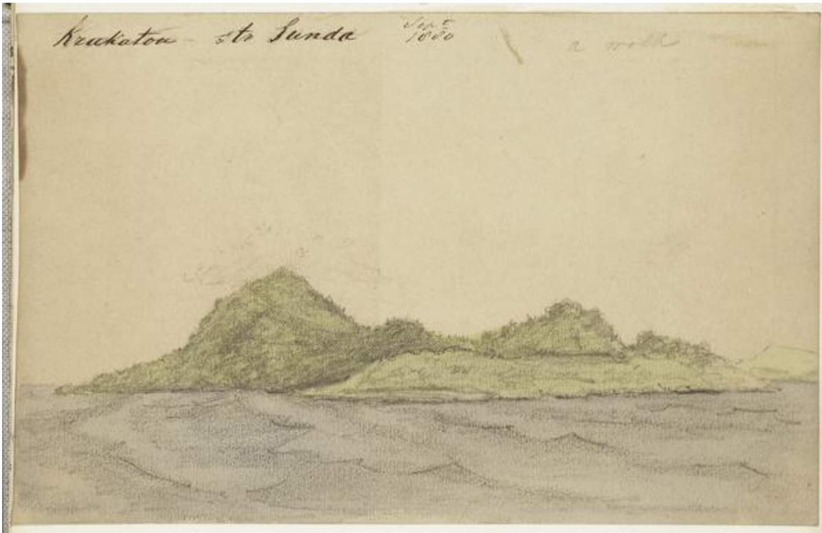
Illustration of the volcano Krakatau in the Sunda Strait. Drawing by O.G.H. Heldring, 1880.