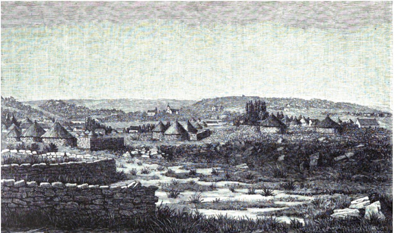
This illustration of Botshabelo, made some time after 1882, depicts houses, fields, and walls erected by the inhabitants.