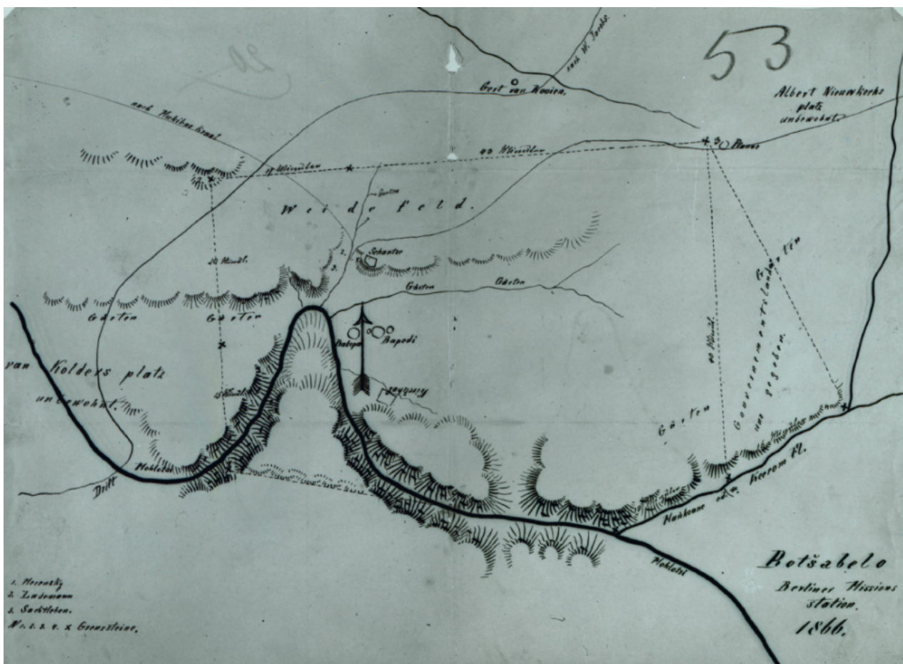
Map pinpointing Botshabelo, 1866.

We find the account of the founding of the Botshabelo missionary settlement in 1865 in Merensky’s “My Missionary Life in Transvaal” (1888 [1996]). Located between “rocky and swampy areas,” the missionary and the Bapedi and Bakopa people, who had been displaced from their previous villages, carried out the works. Stones and pieces of rock had to be carried, dragged, and even blasted away. The clearing of the land for agriculture reshaped the landscape and structured the multiethnic society of the village. In the beginning, the villagers worked the soil with hoes, and later also with plows to cultivate corn.