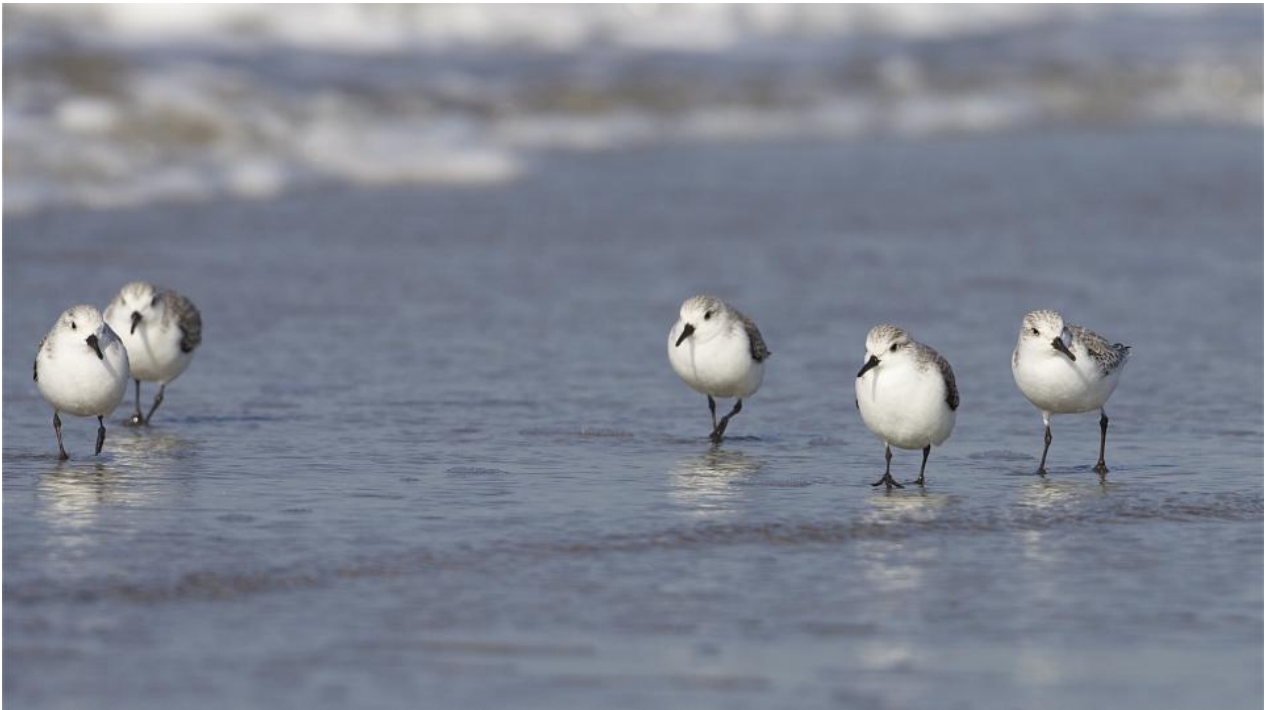
Five Sanderlings ( Calidris alba )

The sanderling, then, is bound to disappear, as was always its fate. In speaking about loss in the context of a bird who continually loses the ground beneath its feet and the marks it makes on the soil, this is a particularly resonant poem for the Anthropocene—a time in which we stand to lose so much, not least sandpipers, a family that includes a number of birds on the IUCN red list of threatened species. Still, the internal rhyme of the poem's final two lines conveys a sense that although short lived, the sanderling's fight for existence was not entirely misguided: it hints that there has been harmony, beauty, and a sense of belonging in its being.