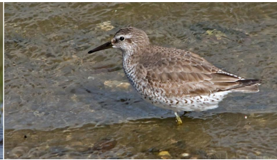
Red knot ( Calidris canutus )

This work is licensed under a Creative Commons Attribution-NonCommercial-NoDerivs 2.0 Generic License .