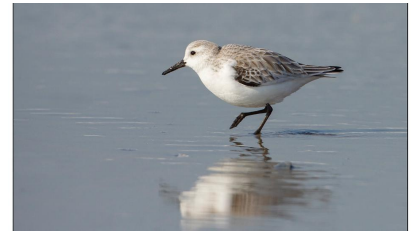
Sanderling ( Calidris alba )

This work is licensed under a Creative Commons Attribution-NonCommercial 2.0 Generic License .