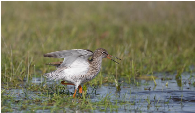
Common Redshank ( Tringa Totanus )

The Wadden Sea is a unique site, and one that raises particular questions about conservation, partly due to its significance for migrating birds. For much of the year, the Wadden Sea lacks many of the species it is protected for. It is a site in sequential waiting: for the redshank ( Tringa totanus ) to breed in springtime, the red knot ( Calidris canutus ) to feed in autumn, and the sanderling ( Calidris alba ) to overwinter. The Wadden Sea's physical constitution reflects its changing population: it too shifts shape with each coming ebb and tide, as sand and silt are removed from one place and deposited elsewhere, and its islands migrate slowly eastwards. Today, the Wadden Sea's changing nature is exacerbated by rising sea levels and changes in the behavior and distribution of species as a result of climate change.