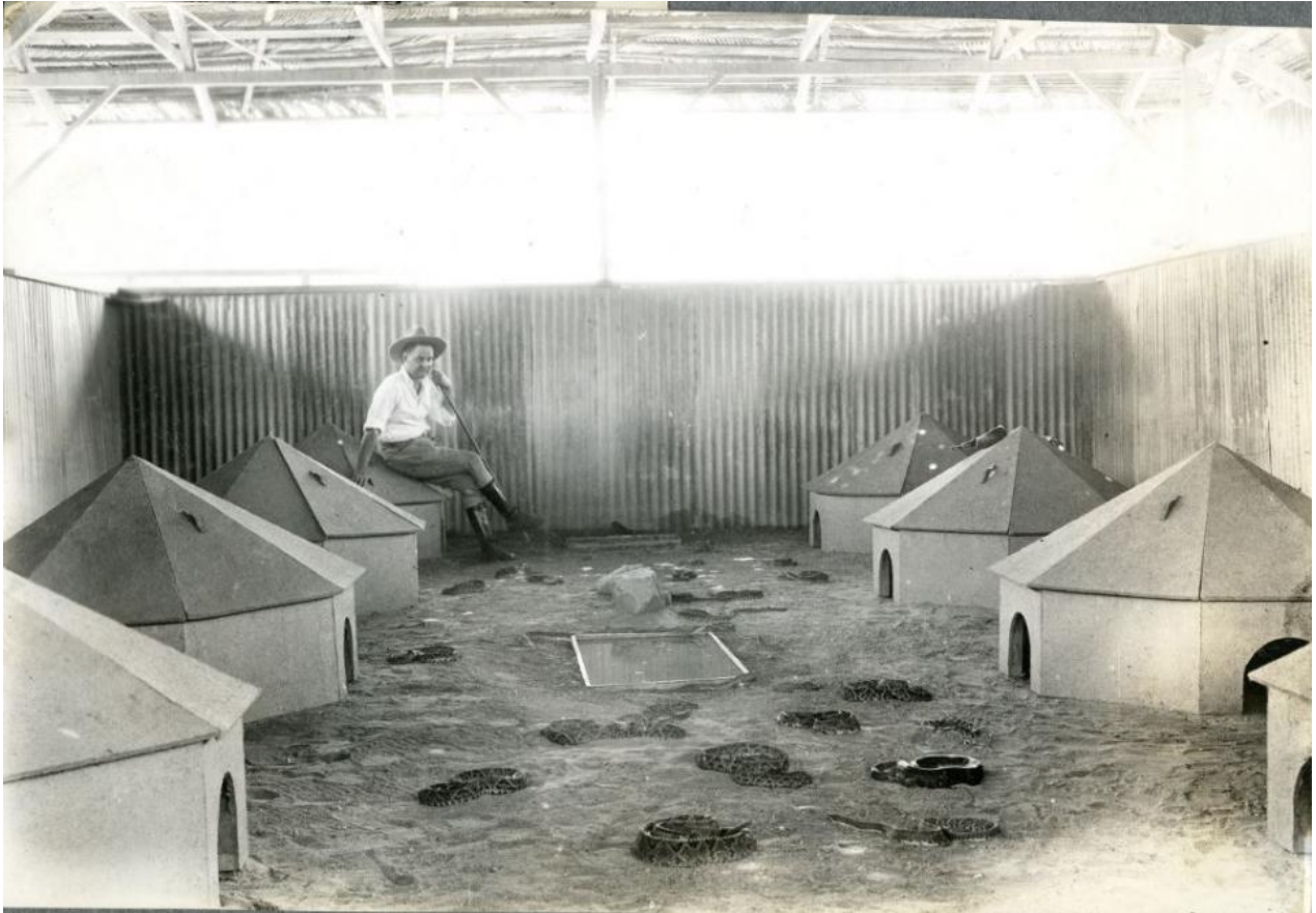
Interior of the United Fruit Company Serpentarium.

particular, was a known presence on the bananeras , and workers who fell victim to their bites sought treatment from both plantation medical facilities and local healers. Scientists at the Experiment Station milked the venom from these snakes, and shipped it northward to the Mulford Laboratories, where it was in turn converted into experimental antivenins, and subsequently tested for efficacy by injection into horses.