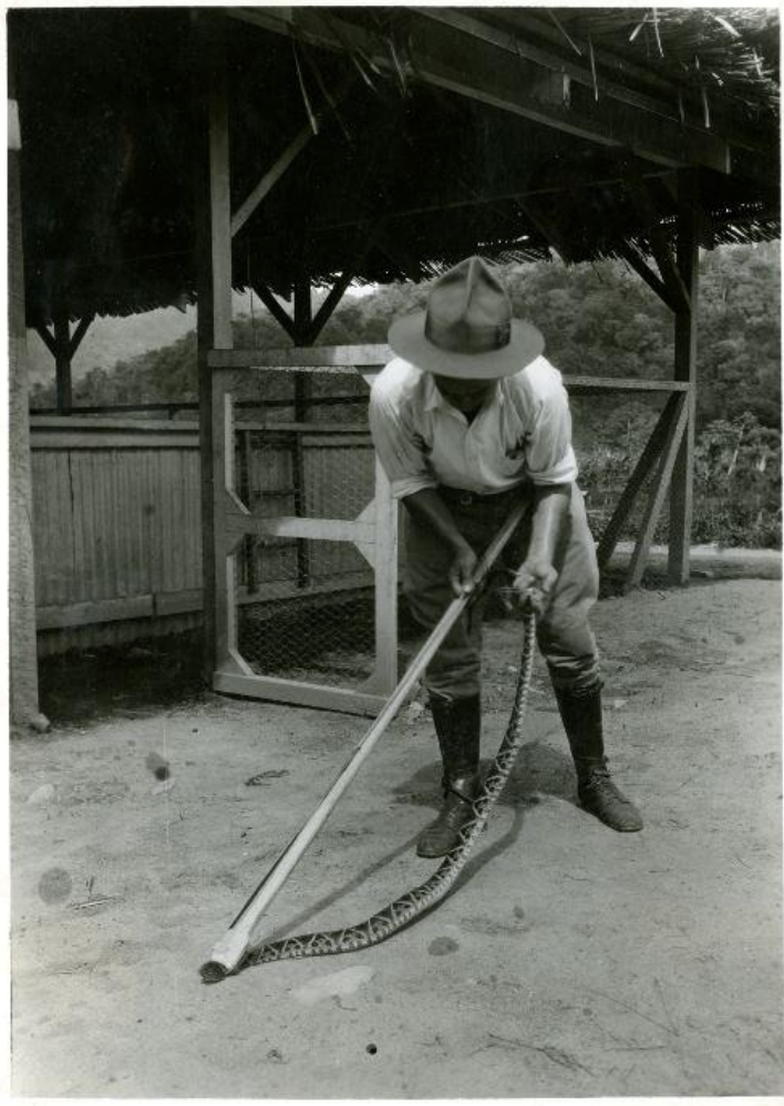
Snake and snake-handler at the Lancetilla research station, 1920s.