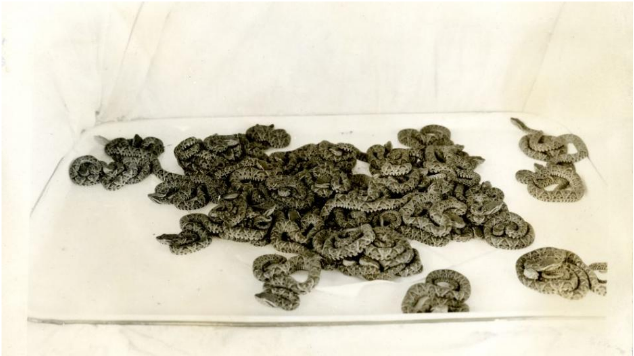
Baby snakes likely propagated for antivenin research.

In January 1926, UFCo finished the construction of the main facilities of the Lancetilla Agricultural Experiment Station in Honduras. A five-kilometer tramway connected the station to the Caribbean port town of Tela, which served as a key hub of UFCo administration and infrastructure. The purpose of the station was to conduct research relevant to the large-scale cultivation of tropical fruit, and included research on pests, plant diseases, cover crops, and new fruit varieties. Among the projects that took place at Lancetilla, the Serpentarium stands out. Established in 1926 as an official branch of the Antivenin Institute of America, this snake facility was a collaboration between UFCo and the Pennsylvania-based Mulford Biological Laboratories, and scientific experts such as Brazil's renowned herpetologist Dr. Afrânio do Amaral.