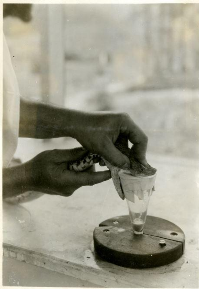
A snake being milked for venom at the research station.

took this image, labeling it simply and tellingly: “Bakery equipment.”