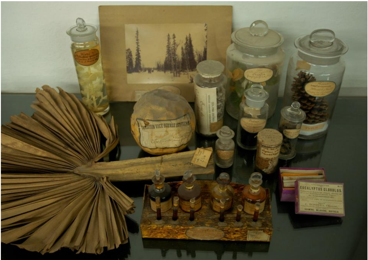
Figure 5. A selection demonstrating the diversity of the “carpotheque” collection, much of which was originally displayed in the “prodotti vegetali” exhibition: a palm leaf collected by Odoardo Beccari; the flower of Tozzettia persica (in spirits) grown in the botanical garden in 1854; the photograph of a wintry forest landscape in the far north of Finland (“Torneo” and “Kittila”); a dried “coloquinte” (desert gourd) from the “Exposition Vice-Royale Egyptienne”; cotton seeds from Italy’s colony of Eritrea (1903); paper flowers made of Aralia papyrifera ; a pinecone from the type Pinus soulangeana bought in London, 1862; Strychnos nux-vomica obtained in an exchange with the Museo Tecnologico, Florence, 1878; indigo “di una pianta indigena della Confed. Argentina” donated by Sig. Durrassi in February 1868; Trapa natans from the “antica collezione dei museo”; fiber and fabric from Lupinus albus ; Eucalyptus globulus cigarettes from a chemist in Melbourne; and a selection of beautifully presented local Tuscan flax oil.