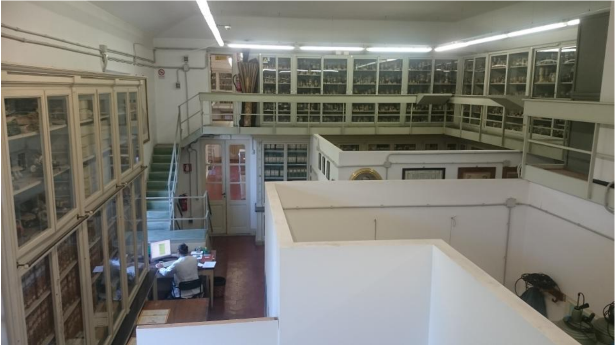
Figure 4. The “carpotheque” collections (continuing in the following room) housed in 33 gallery cabinets above the comings and goings in the new office spaces. Some of the palms that were displayed in the center of the Galleria dei Prodotti Vegetali are visible by the door.

including evolution and conservation. In contrast to Parlatore’s ambition towards universality or completion, this guide to the downsized museum apologetically claims that it cannot cover all aspects of botany. Instead, it offers a set of perspectives through which the visitor can explore the collections—an approach that is nonlinear and multilayered.