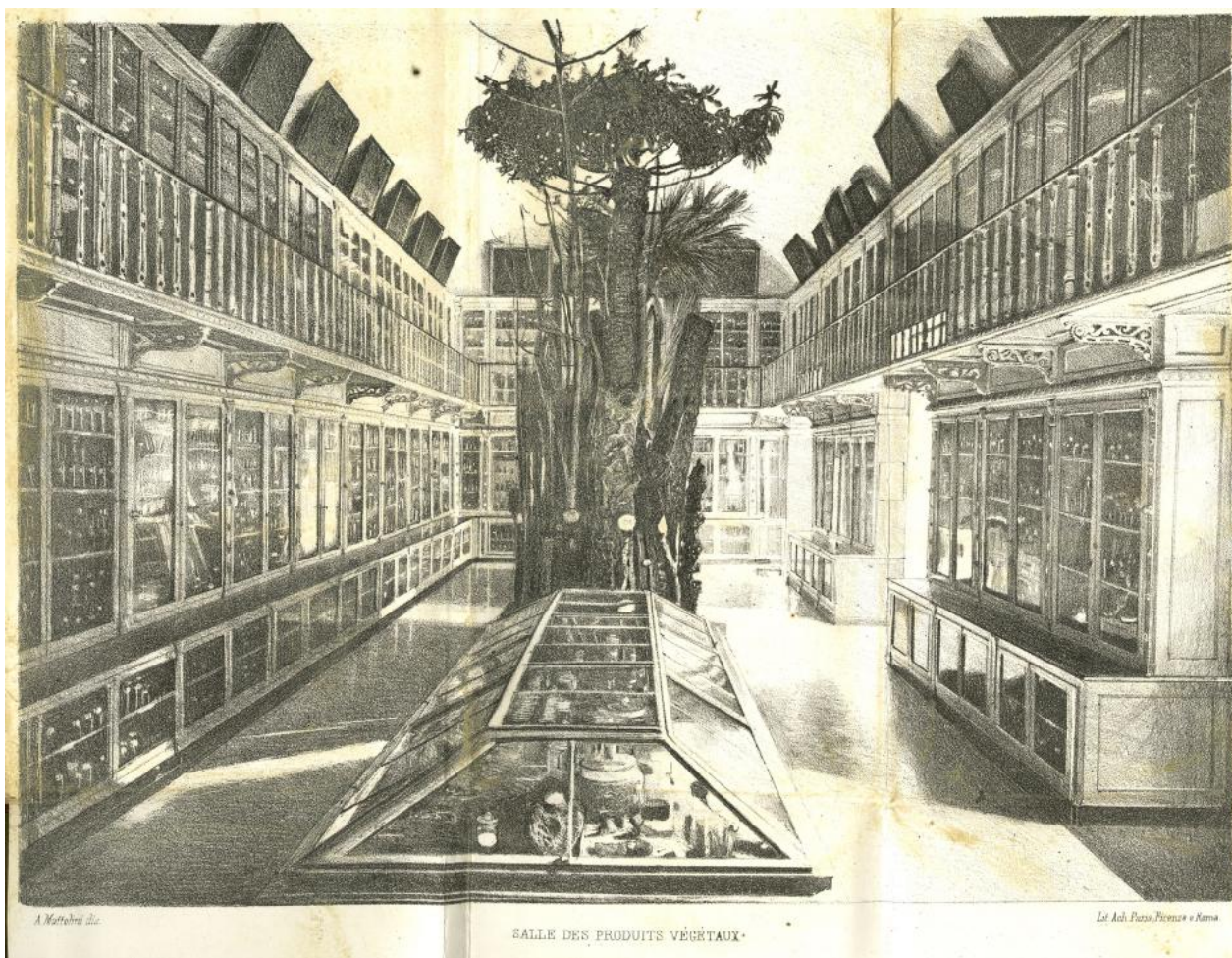
Figure 1. A print of the gallery of vegetable products from Filippo Parlatore’s 1874 catalogue Les Collections Botaniques du Musée Royal de Physique et d’Histoire Naturelle de Florence .

Philippe Parlatore, Les Collections Botaniques du Musée Royal de Physique et d’Histoire Naturelle de Florence au Printemps de MDCCCLXXIV , (Florence, 1874; anastatic reprint, 1992).