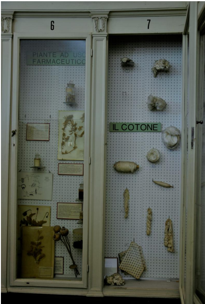
Figure 3. The pharmaceutical cabinet brings together “prodotti vegetali” and herbarium specimens for several important drugs, including cannabis, marijuana, and opium. The cotton cabinet depicts the process of production from plant to commodity, from the cotton pods to woven fabric, following the same progression as the linen display in cabinet 8.