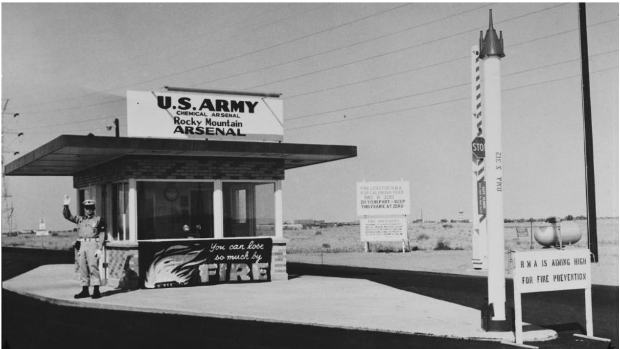
A 1960 photograph of an unnamed guard at the south entrance of the Rocky Mountain Arsenal. Signs encourage visitors to do their part to prevent wildfires.