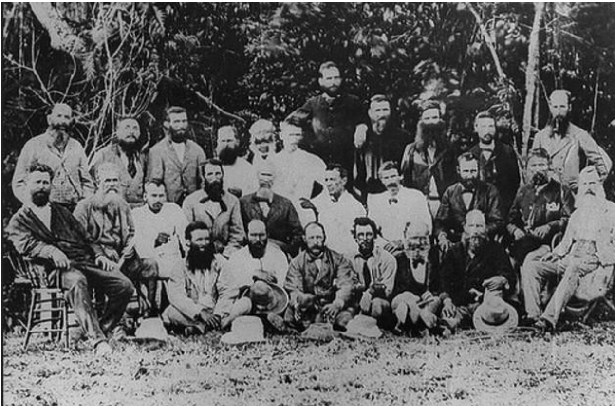
Samuel Griffith on an electioneering tour to the Herbert. Pictured with local landowners and businessmen, 1883. Griffith was Premier of Queensland from 1883 to 1888 and again from 1890 to 1893. When he became Premier in 1883 he replaced Premier Thomas McIllwraith. This was a blow to the planters because McIllwraith favored the importation of colored labor while Griffith opposed it.

attracted to the Herbert when government legislated for land ownership by a yeomanry class of white agriculturalists in order to stimulate agricultural production and to promote settlement for the defense of what was regarded as a tropical outpost. The small selectors farmed small crops and planted fruit trees. They kept pigs and fowls and both beef and dairy cattle. They supplemented their farm income with outside work such as fencing and building, timber getting, and pit sawing. By these means, they subsisted while supplying both the large sugar plantations and the wider community as it developed.