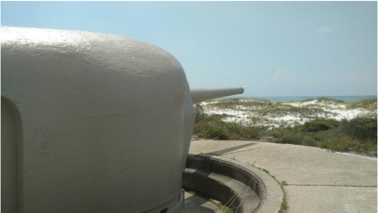
Battery 234, Fort Pickens, Florida, Gulf Islands National Seashore.

bulkhead to hold the island in place, defending Mississippi Sound by preserving the fort.