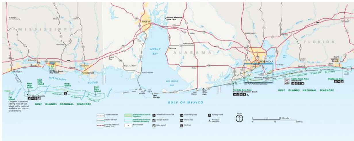
Map of Gulf Islands National Seashore, 2016.

Gulf Islands National Seashore was established in 1971 by the United States Congress, along the northern edge of the Gulf of Mexico. The park includes fringing barrier islands and some coastal spaces on the mainland of Florida and Mississippi. The national seashore encompasses over 40,000 hectares that include white sand beaches, uninhabited barrier islands, and the remnants of the Spanish, British, French, and American military fortifications, which provide much of the elevation in this low-lying sandy landscape.