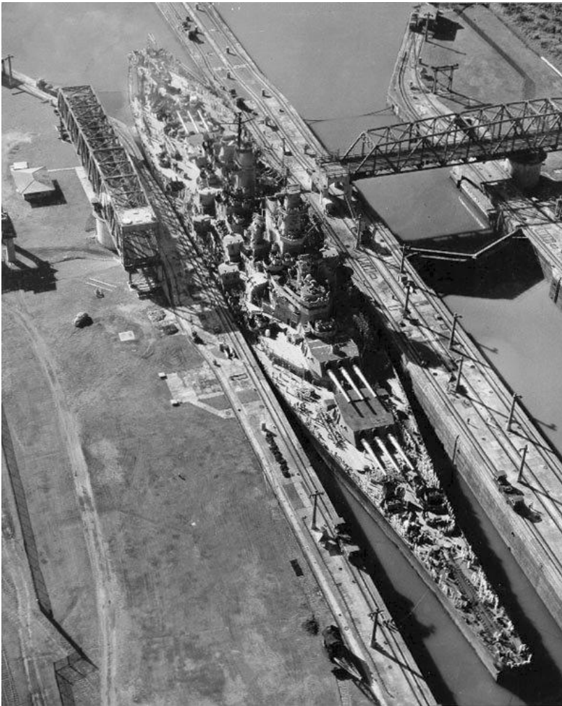
The USS Missouri making its way through the Miraflores locks, 13 October 1945.