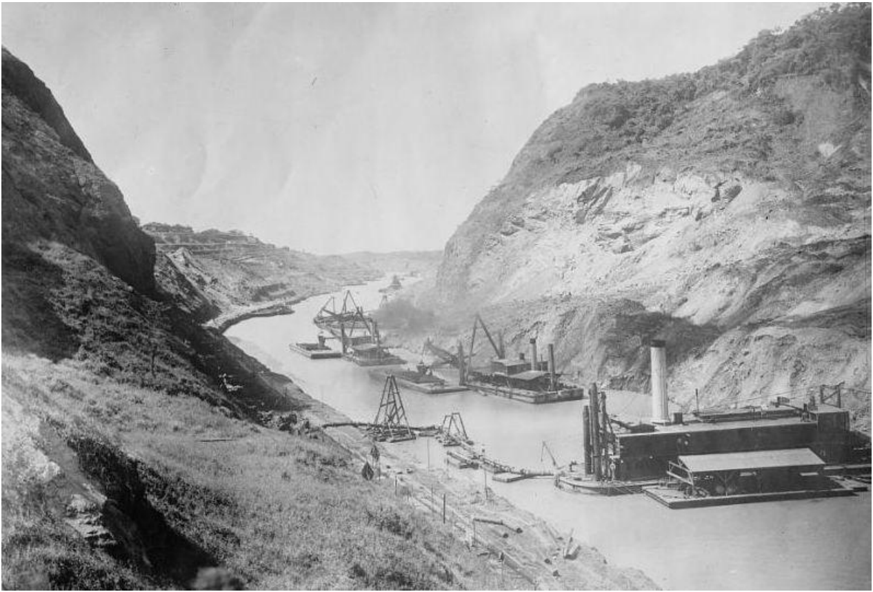
Photo of the dredges removing material from the Cucaracha slide in the Culebra Cut, ca. 1913.

Courtesy of Library of Congress, Prints & Photographs Division, LC-DIG-ggbain-17283. Accessed on 12 March 2019. Click here to view source.