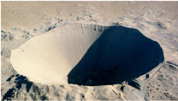
The Sedan Crater at the Nevada Test Site, n.d.

suggesting, "The banks of a nuclearly excavated canal would be natural angles of repose and therefore would be stable." The more nuclear tests the AEC conducted, however, the more slope stability seemed to be the bane of the technology. The 1962 Danny Boy Test reinforced this concern. Danny Boy's slopes were as steep as 45 degrees near the top of the crater and had resulted from only a 0.4 kt blast. The AEC suggested that 5 to 10 Mt devices were necessary to cut through the rocky continental divide of the Isthmus. There was a distinct potential that exponentially larger blasts might spawn exponentially steeper slopes as well.