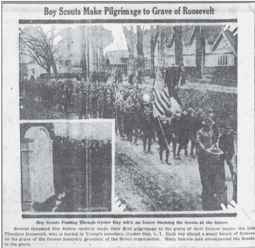
Fig. 3. Boy Scouts undertake patriotic pilgrimage to Theodore Roosevelt's grave to honor the BSA's Chief Scout Citizen