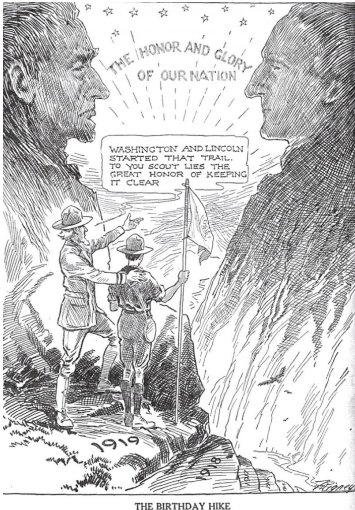
Fig. 2. Uncle Sam guides a Boy Scout on Washington's and Lincoln's trail to national honor for the BSA's anniversary week. Illustration by Frank Rigney.

Originally published in Scouting (9 January 1919): 8.