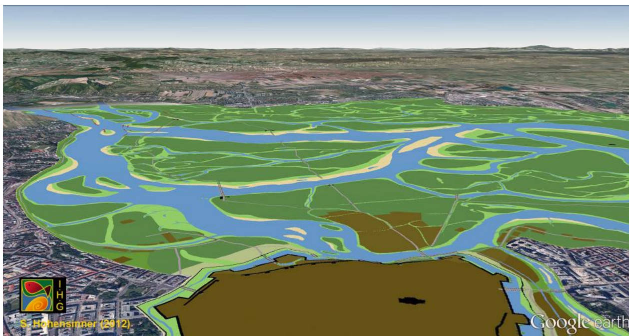
View from the historical city centre over the Danube river landscape towards north in 1570 (FWF Project-No. P 22265-G18)