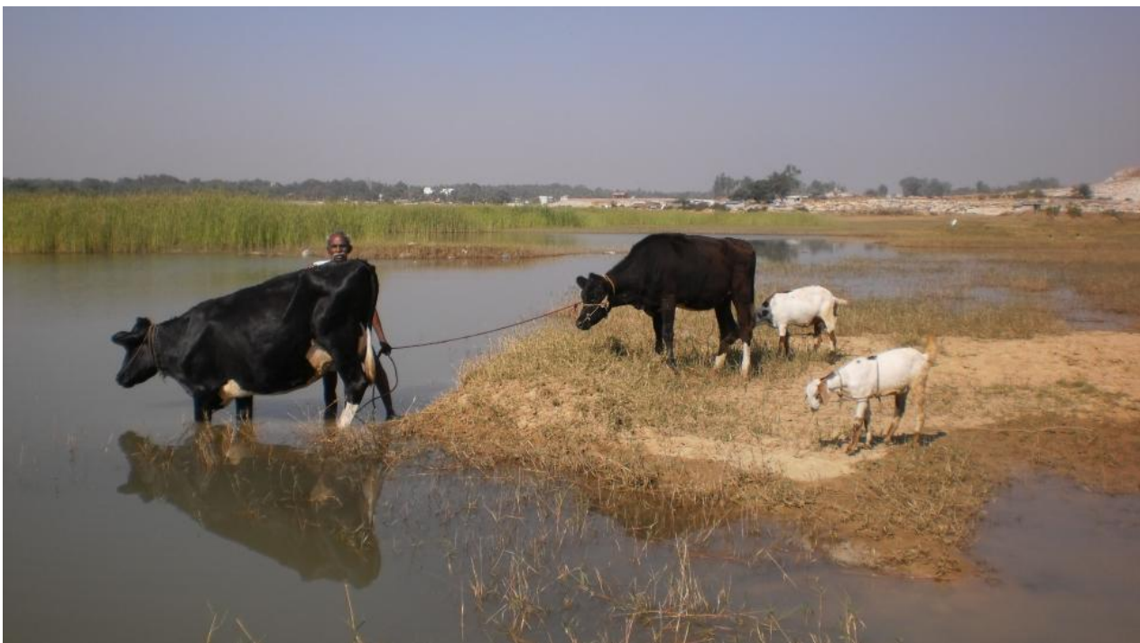
Figure 5. Grazers washing cattle in a lake in Bangalore

recent years, following widespread water shortages across Bangalore and occurrences of large polluted lakes frothing and even catching fire, the importance of lakes for ground water recharge is now recognized. Since the mid-2000s, many lakes across the city have been restored through the efforts of local communities working with the government. Yet such restoration typically involves fencing and restrictions on lake access (Figure 3), enforced by security guards. Such a vision of the lake favors recreational use, while banning consumptive use by fodder collectors, fishers, migrant labour and washer communities (dhobies) to name a few (Figures 4 and 5). This has distanced many low-income communities from lakes they once actively engaged with and managed for centuries. This, despite the fact that these lakes still continue to support and sustain several livelihoods through the agriculture, fishing, livestock rearing, and foraging activities they enable.