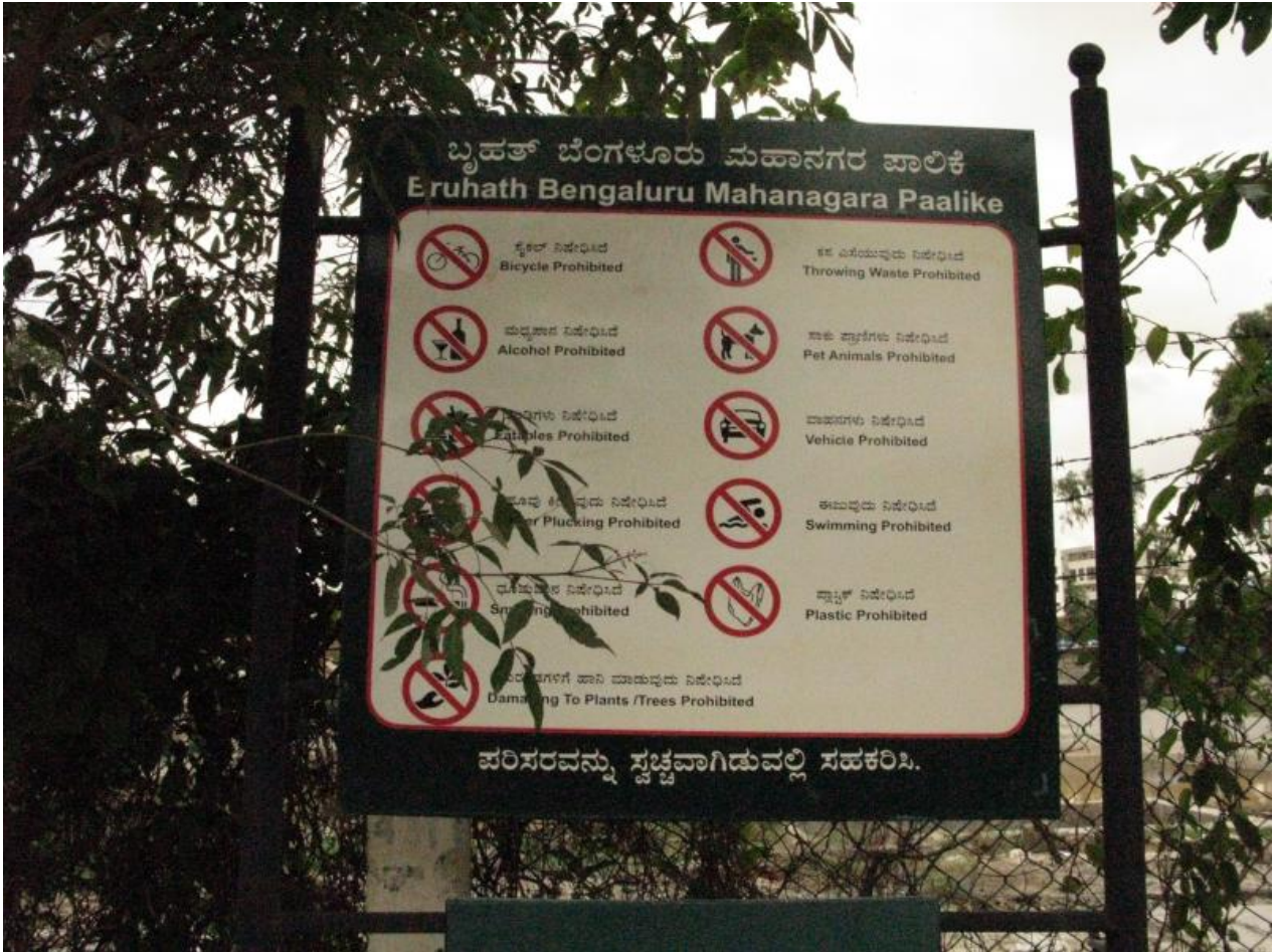
Figure 3. A sign inside a lake specifying restrictions on lake use