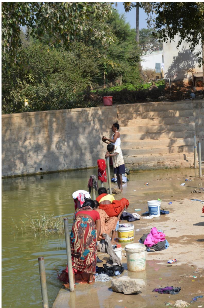
Figure 4. A family of commercial launderers ( dhobies ) washing clothes on the bank of a lake in Bangalore