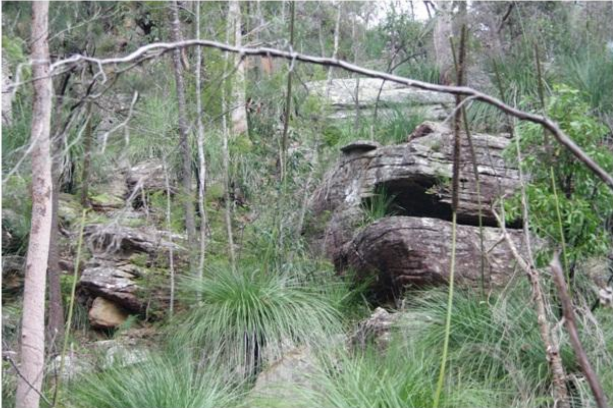
The rocky sclerophyll landscape in Ku-ring-gai Chase National Park

Management documents often position rabbits as not belonging in Australian national parks as they challenge human ideas of “nature” and can pose a threat to the conservation of native species. In Ku-ring-gai Chase the management of rabbits is unquestionably concerned with their removal and destruction, through rabbit control measures, such as baiting, trapping, shooting, habitat destruction, and the release of biological control measures including rabbit haemorrhagic disease virus (RHDV).