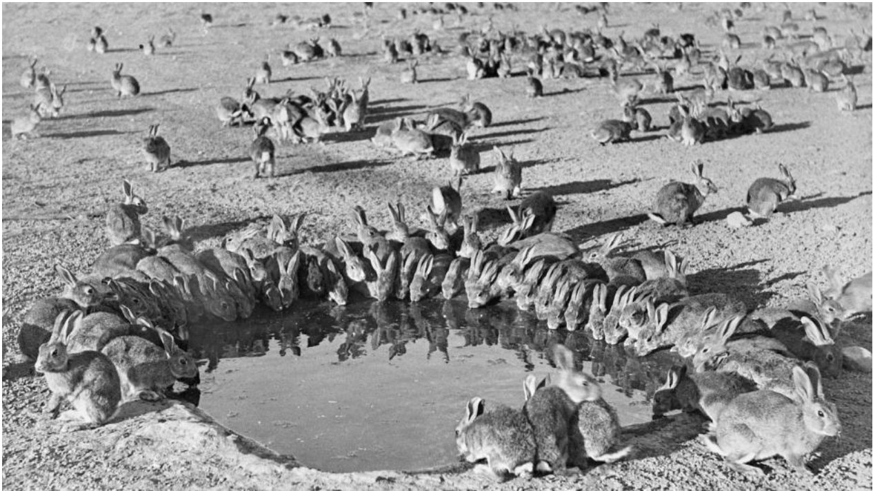
Rabbits in plague proportions in 1938

attract rabbits. Processes such as gardening, turning up fresh dirt, mowing lawns, and planting vegetables and herbs draw rabbits to these spaces and provide them with ample food. As the availability of food impacts on the breeding cycles of rabbits, these human practices not only ensure that rabbits survive, but also that the populations of rabbits around Ku-ring-gai Chase can breed continuously throughout the year.