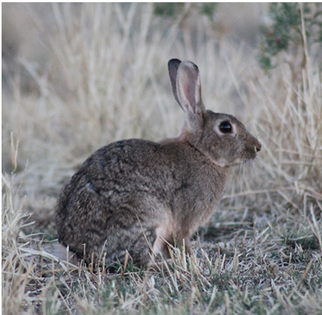
European rabbit, Oryctolagus cuniculus

pests in all states and territories across Australia and it is a legislative requirement that all public and private landowners take action to manage population numbers on their land.