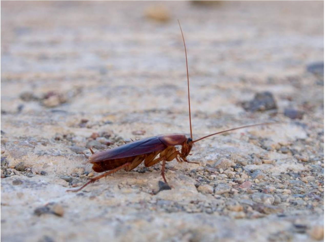
P. americana , view from side