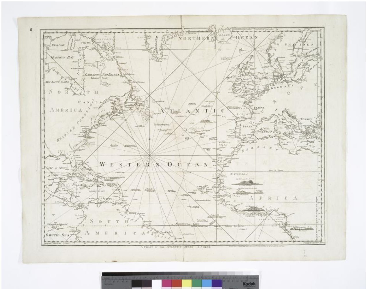
A chart of the Atlantic Ocean