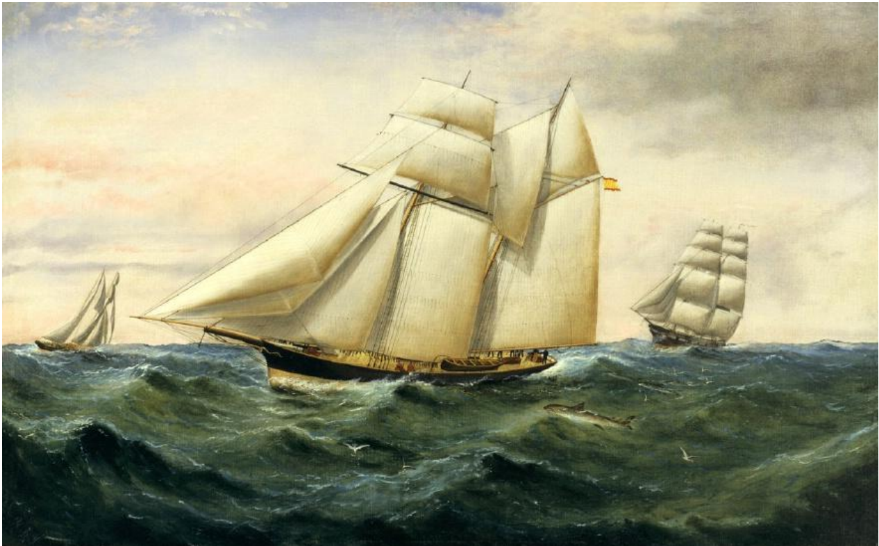
A painting of the USS Wanderer (1857)