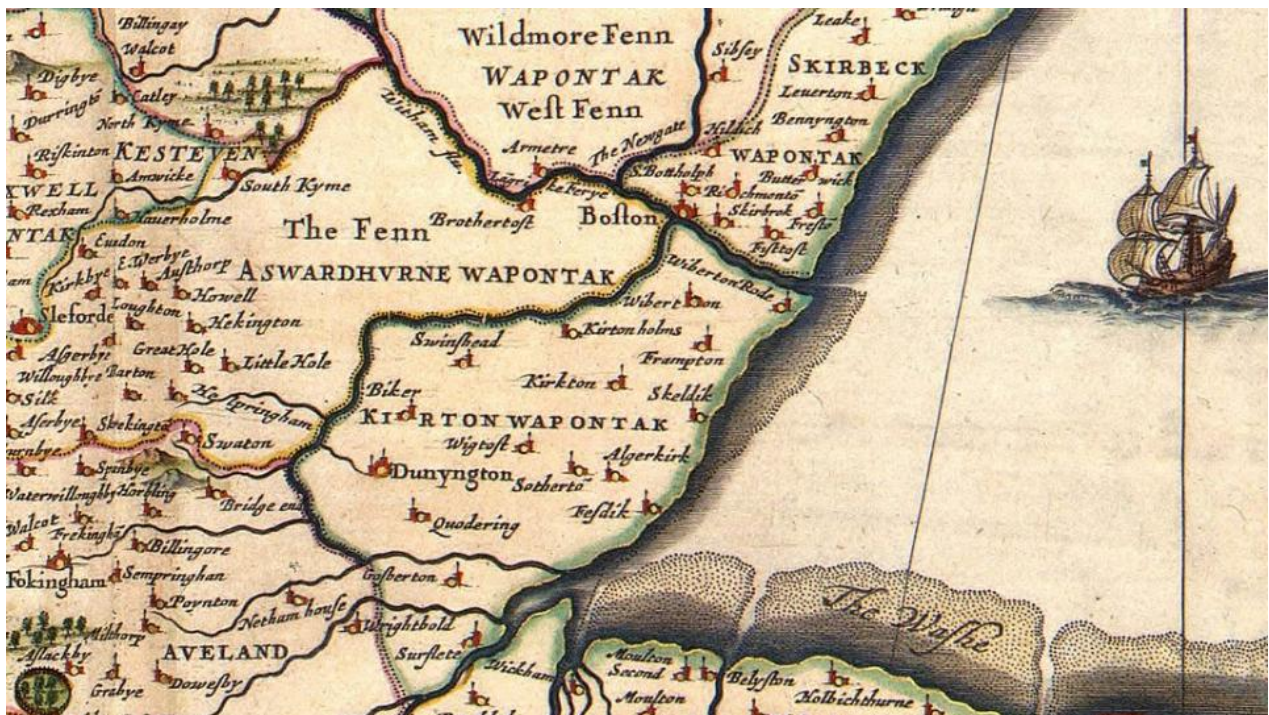
Jan Janssonius, Atlas Novus vol. 4. Map depicting unsettled areas amidst the undrained fenlands.

Thomas Dekker, News from Graves End (1604)