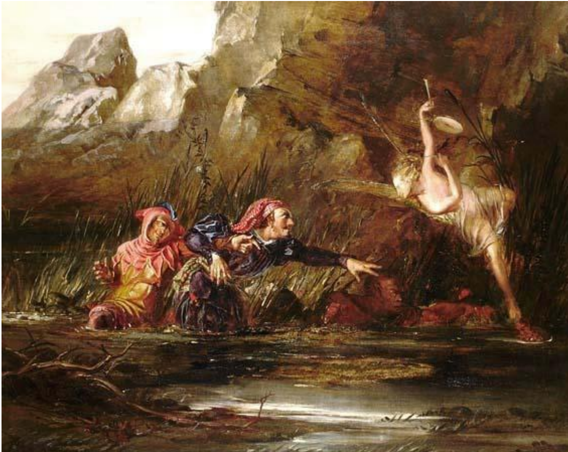
"All the infections that the sun sucks up / from bogs, fens, flats..." Ariel and Caliban by William Bell Scott, 1865. Oil on canvas.

Henshaw's invention is described as utilizing "a very large pair of Organ bellows" to help decompress the air of a chosen room through a copper pipe in the wall and into a bucket of water outside. The purpose of Henshaw's contraption was simple: to simulate the conditions of a foreign climate, with his logic being "that Lice bred on this side the Line, (or Aequator) will immediately all die on the other side the Line." Similarly, it was thought that the artificial creation of a "foreign" climate would be sufficient in deterring unwholesome, malarial airs.