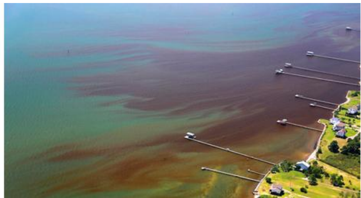
Toxic algae blooms.