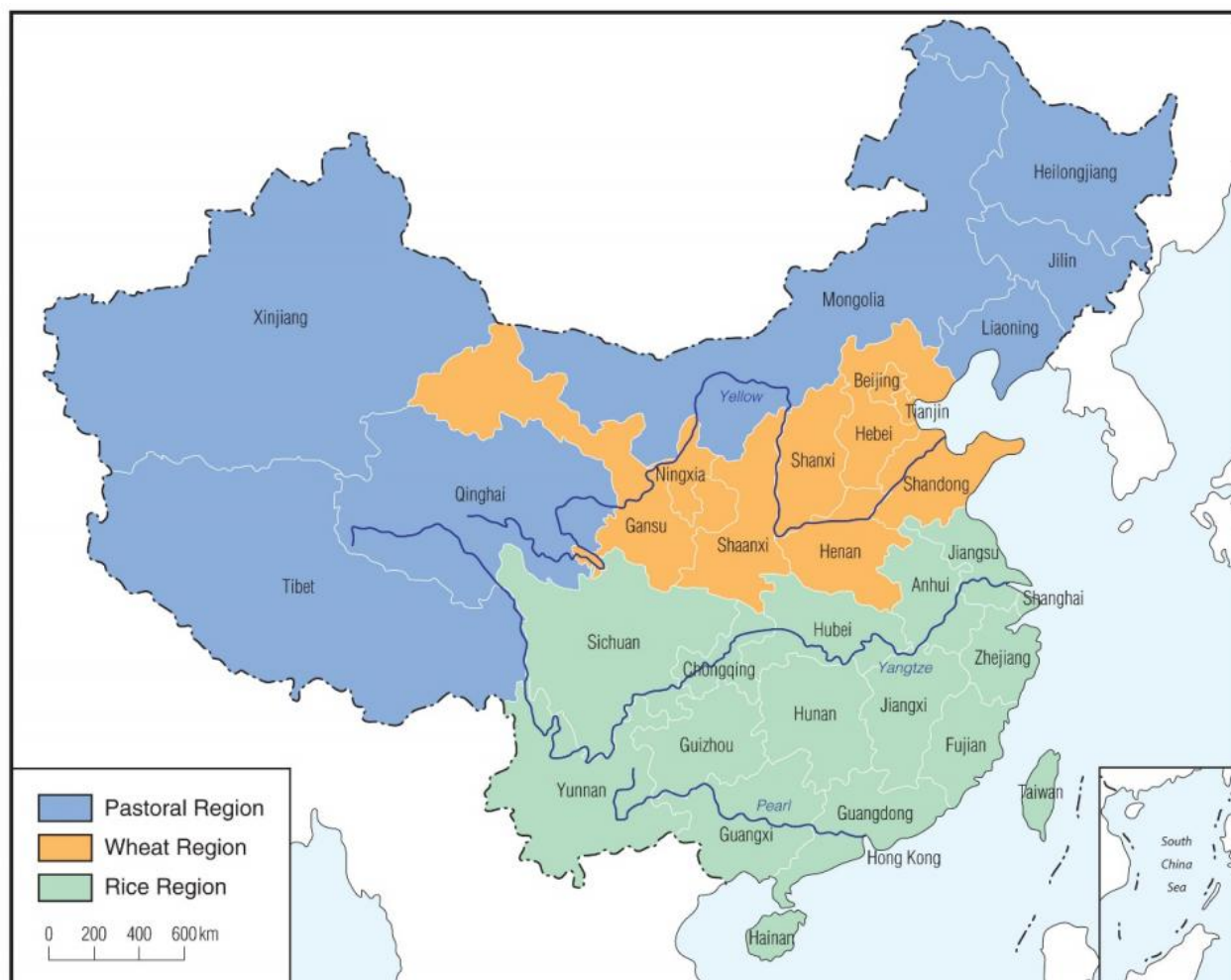
Map showing the three agro-ecological zones in China